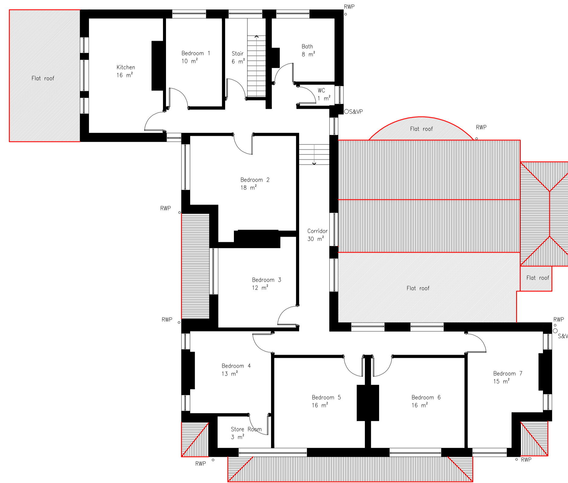
EXISTING FIRST FLOOR PLAN 1:100