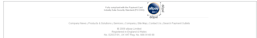
example web site footer