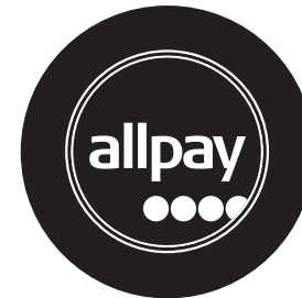
black & white version (limited use only)