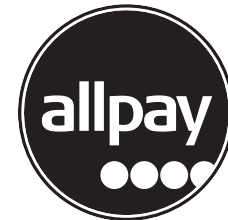
black & white version (limited use only)