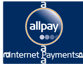
vertical service mark isolation area (dark background)