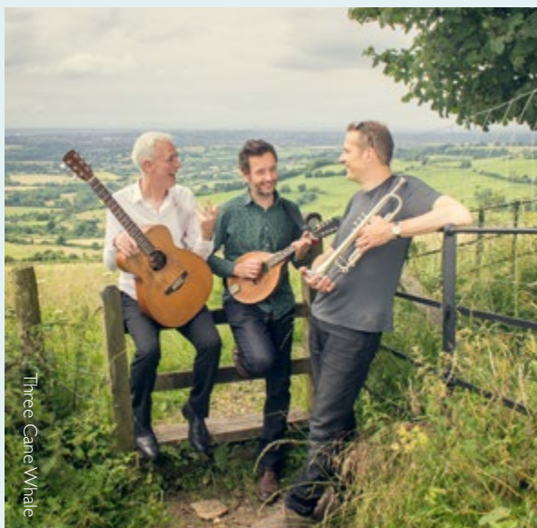
Three Cane Wale