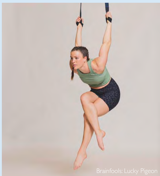
Brainfools: Lucky Pigeon