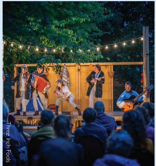
Three Inch Fools