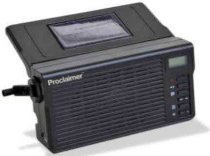
A wind-up, solar-powered Proclaimer