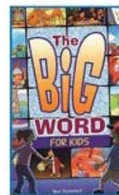
Children's New Testament, distributed through the Amazing Journey Project