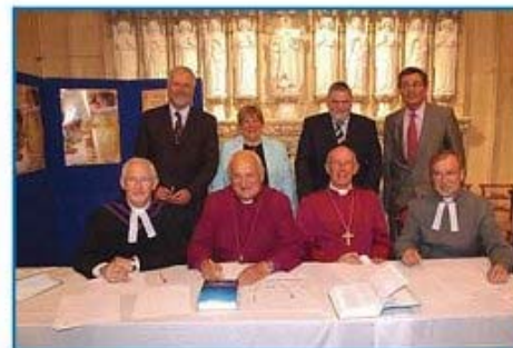
Handwritten Bible Launch, May 2006