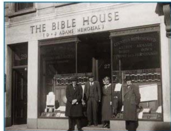
Bible House, 1933

This association with the Howard Street site has continued to this day.