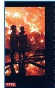
Fire Fighters For Christ, New Testament

Some things remain as important as in the earliest times. Staff continue to speak on behalf of the Society at Sunday worship, midweek meetings, school Assemblies and special events. A Laptop may have replaced glass slides as the means of presenting the work, but face-to-face contact is still felt to be the best way to promote the Society's work, and challenge Christians with the responsibility to share the Bible text with those who have none. Unlike the past, when there was an expectation that a 'Deputation Secretary' would be an ordained Anglican, today staff are now welcomed into a wide range of worship situations and the Society receives gifts and other support from eight different denominations, plus local independent worship centres.