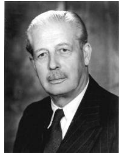
Harold McMillan, minister for Housing and Local Government with responsibility for Health (1951-54)