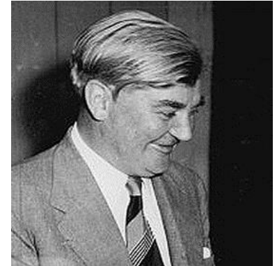
Aneurin “Nye” Bevan, Minister for Health with responsibility for housing (1945-51)