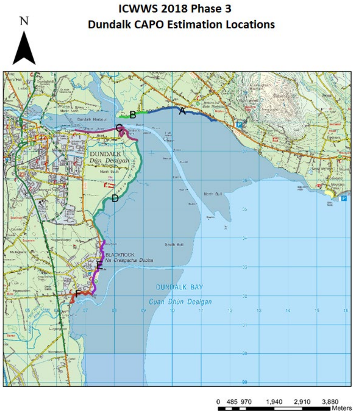
Figure 3.1: Estimation Locations for Dundalk