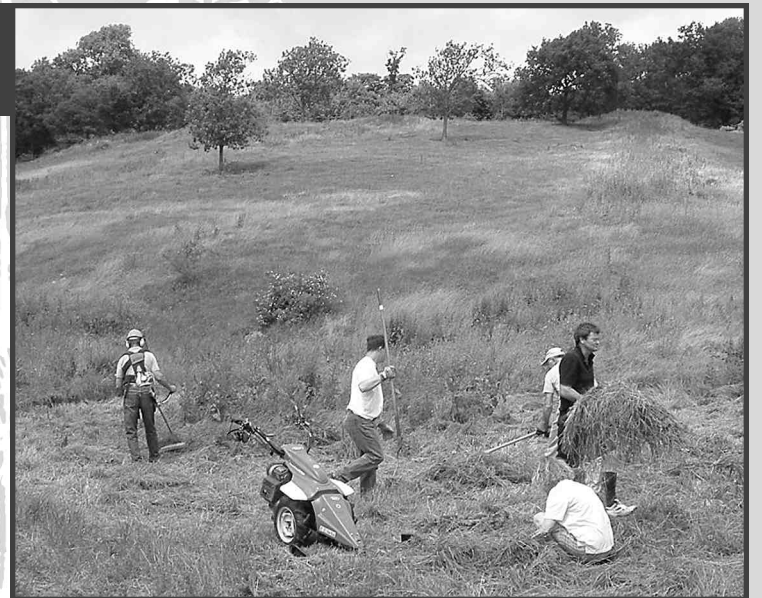
Volunteers mowing the grassland

Management at Jumping Downs is aimed at maintaining the diversity of the chalk downland plants. The site is grazed by cattle between July and March each year. This allows the flowers to grow in the spring and set their seed in early summer, so ensuring they will return the following year. Other important management operations include cutting and removing vigorous species such as dock and removing ragwort, which is harmful to cattle. The woodland is contained at the top of the slopes by controlled cutting in the winter of each year. This maintains what is there, but doesn't allow it to spread onto the wild flower areas.