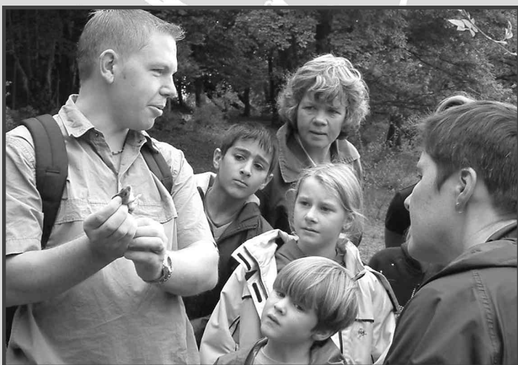
Mammal survey event with local expert

We have practical tasks, wildlife surveys and events running throughout the year. It's a great way to put something back into the community, meet new people and learn about the rural environment. If you would like to join in please contact us to find out what our next event will be.