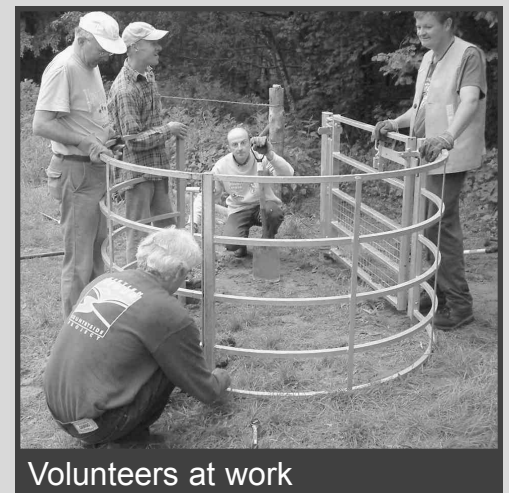
Volunteers at work