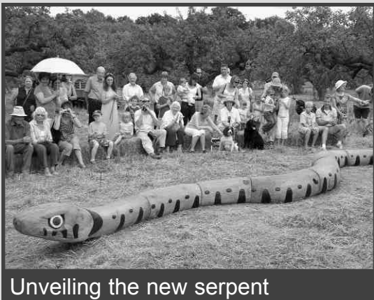
Unveiling the new serpent