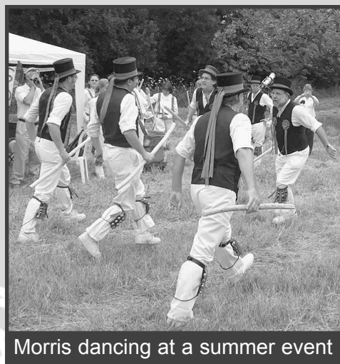
Morris dancing at a summer event