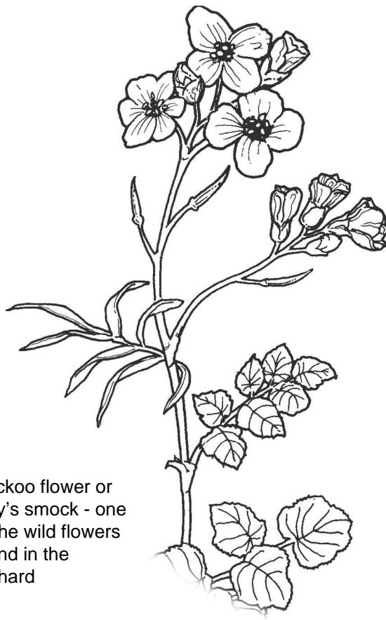
Cuckoo flower or lady's smock - one of the wild flowers found in the orchard

Until 1993 the grassland under the orchard trees had been fertilised and sprayed with herbicides. However, an end to the practice of spraying together with positive management (mowing in mid-June and October) has led to a noticeable increase in the number and diversity of wildflowers growing.