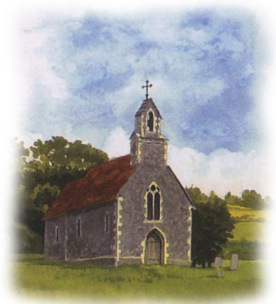
1 St John's church, Milton

Une randonnée des plus agréables le long de la rivière, avec la chance de pouvoir se promener dans une forêt ancienne en empruntant plusieurs pistes balisées.