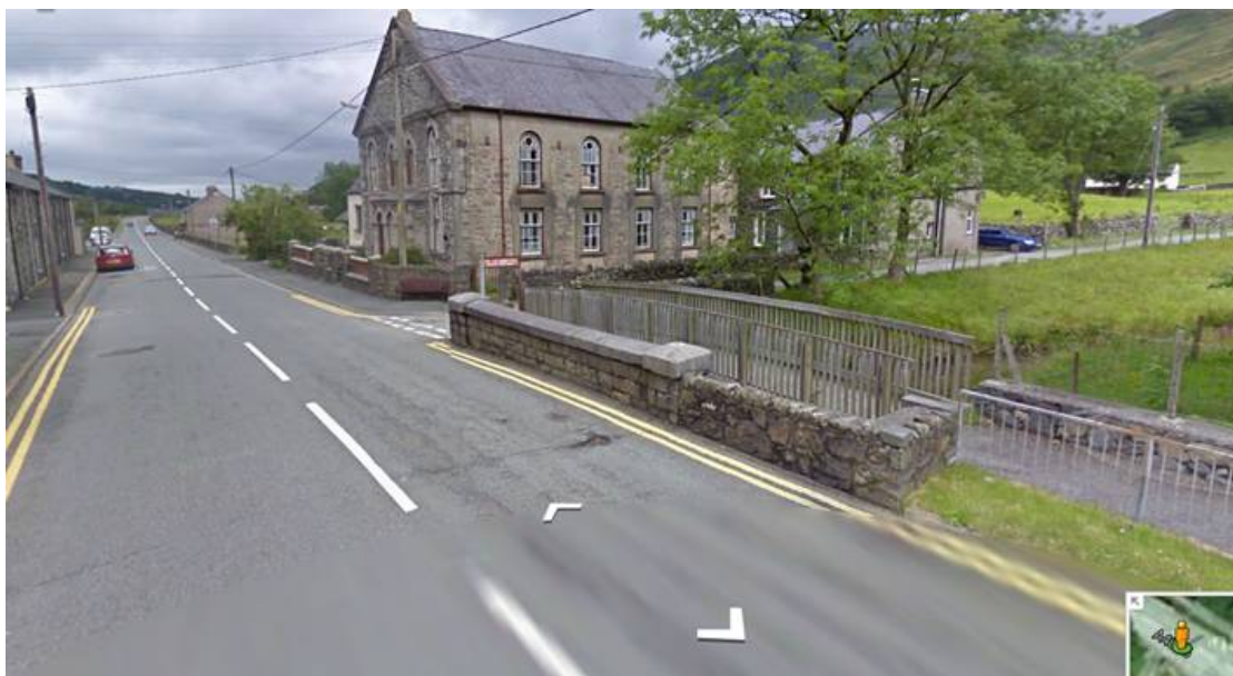
A view from the road of the turning up towards the hut. Cross the little bridge and turn right before the building.