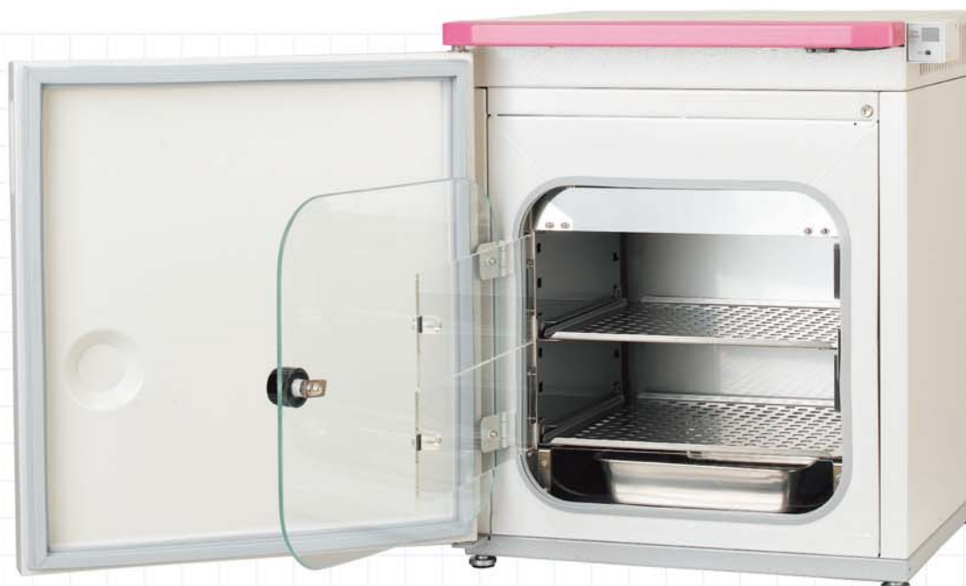
The photo shown is equipped with optional OCC-30D and AP-100.

All the interiors can be removed without any tools for easy cleaning. The chamber construction includes rounded corners helping the cleaning and disinfection process.