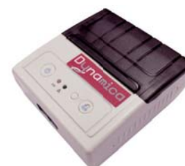
Compact Thermal Printer