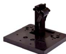
Test Tube Holder