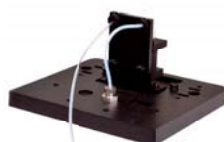
Flow Cell Holder