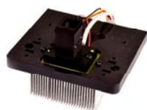
Temperature Controlled Holder