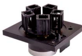
Auto 5 Cell Changer