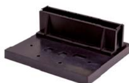
Long Pathlength Cell Holder