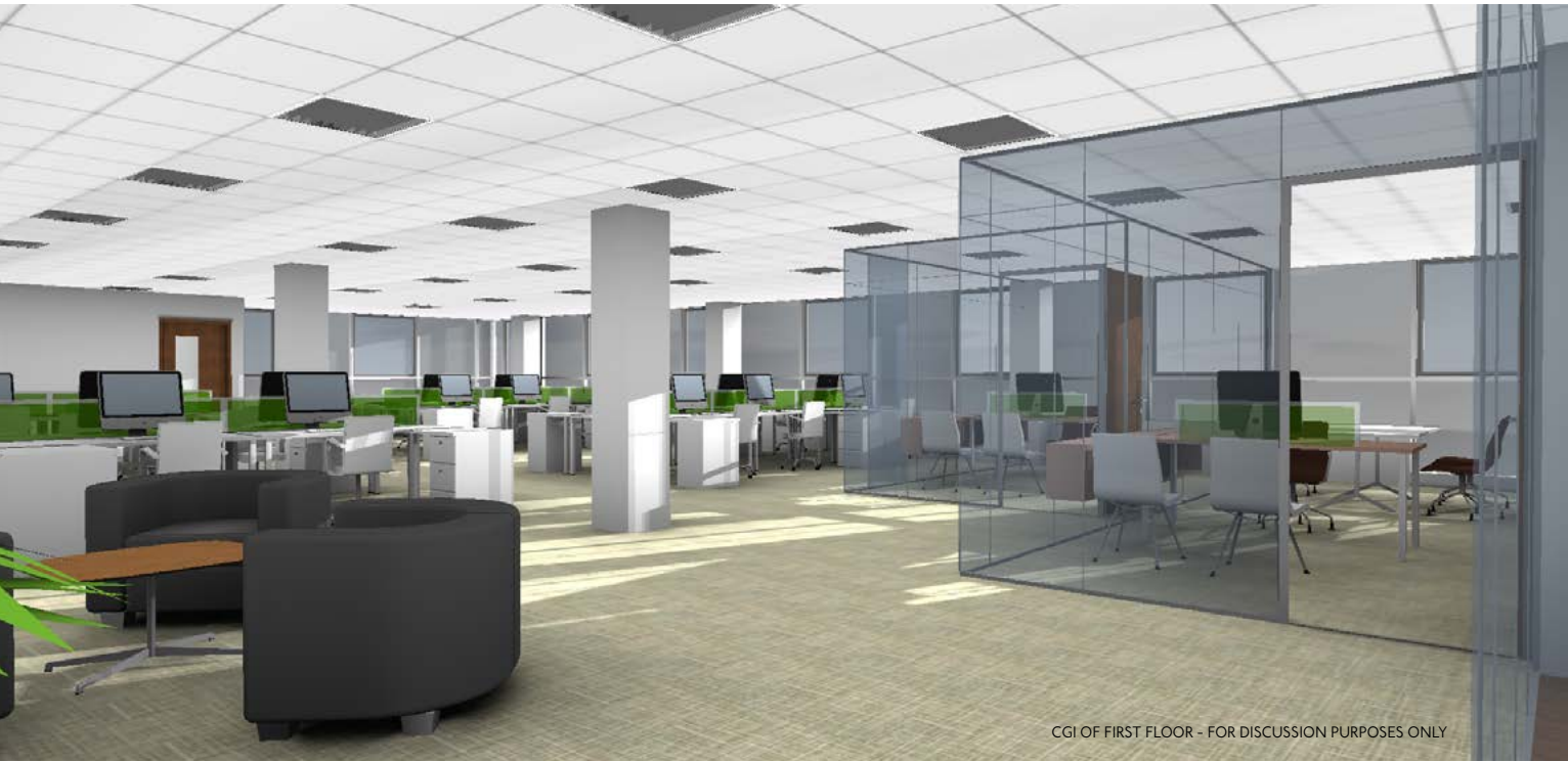
CGI OF FIRST FLOOR - FOR DISCUSSION PURPOSES ONLY