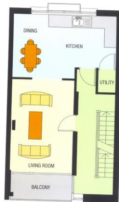
House Type 7 4 bedroom First Floor