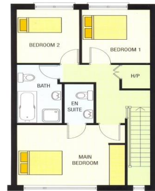
House Type 7 4 bedroom Second Floor

House Type 7 1567 sq. ft. (3 bed with Garage & (4 th Bedroom/ Garden room) Approx. dimensions