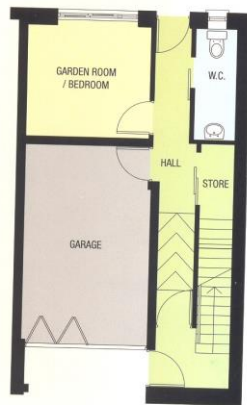
House Type 7 4 bedroom Ground Floor