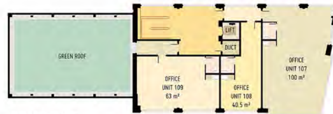
BLOCK A - 2nd floor