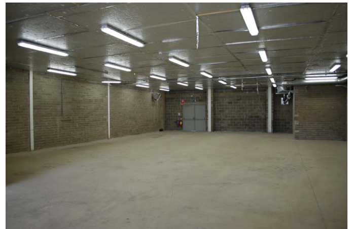
Warehouse Unit 3 - Internal