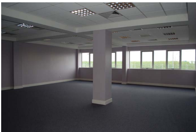
Offices - Ground Floor