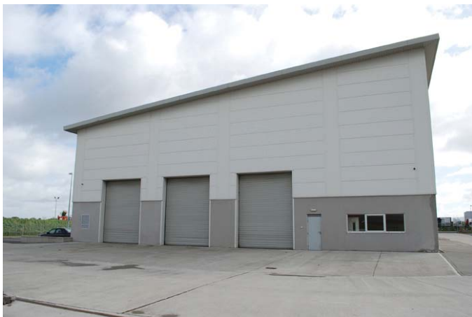
Industrial Warehouse Unit 1 - External