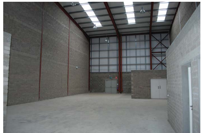
Warehouse Unit 2 - Internal