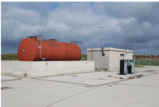
Fuel Pumps & Wash Bay