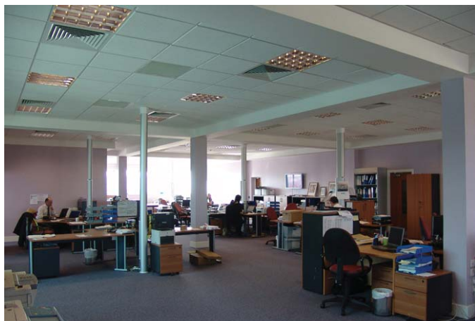
Offices - First Floor