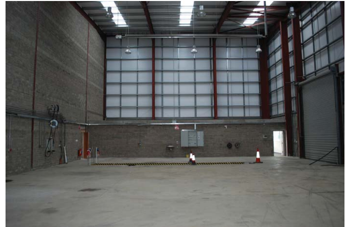
Industrial Warehouse Unit 1 - Internal