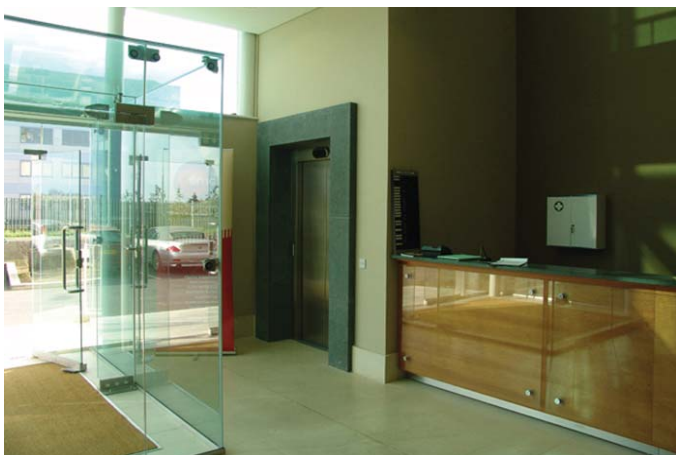
Offices - Reception