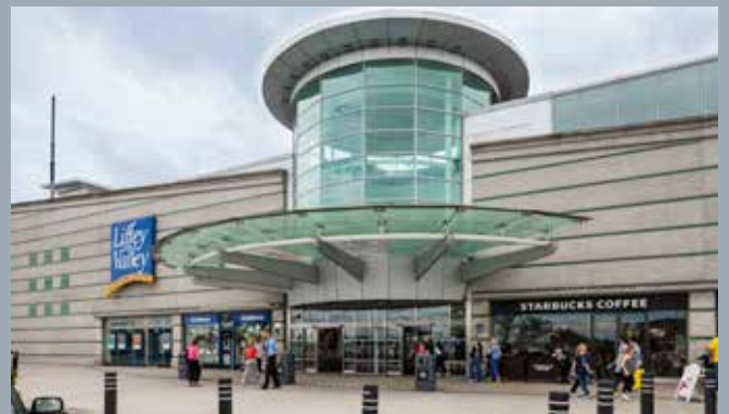
Liffey Valley Shopping Centre