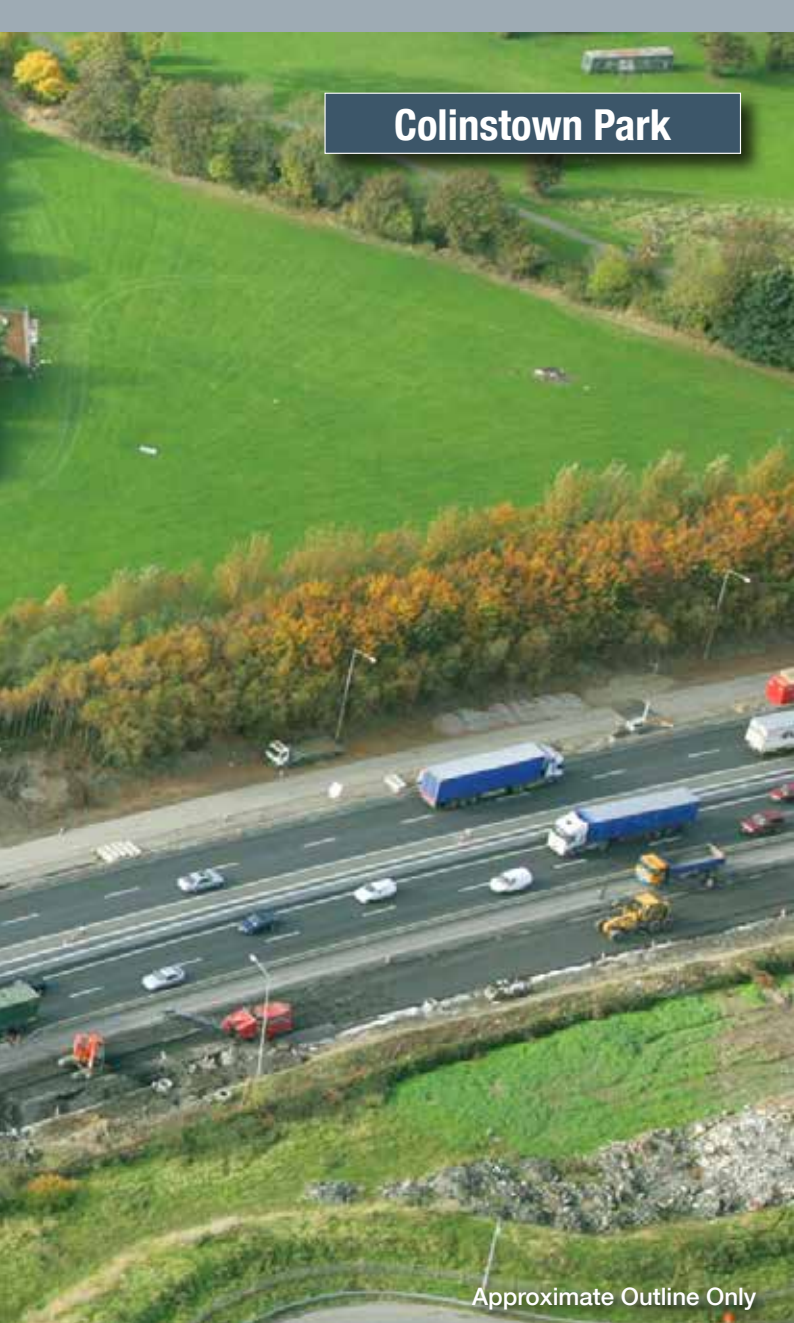
Approximate Outline Only