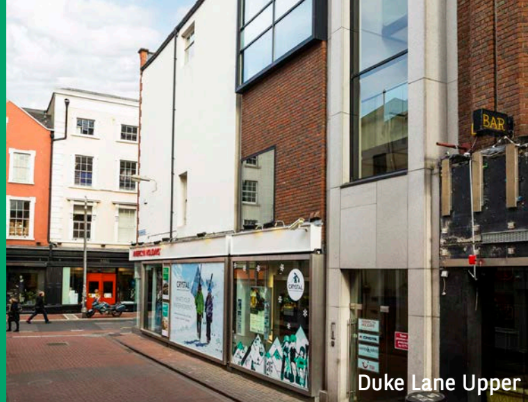
Duke Lane Upper

Alternatively the building can be leased in its entirety where a retailer requires office accommodation.