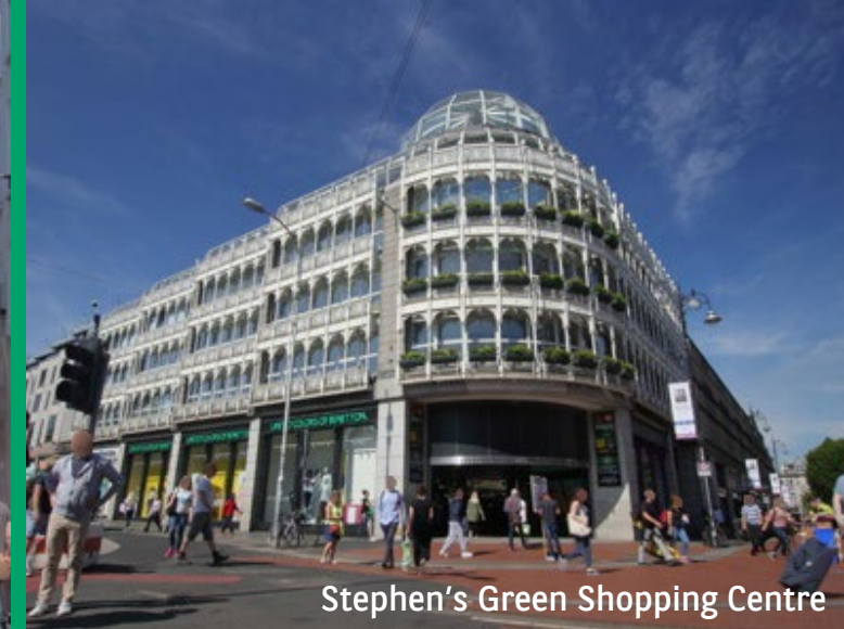
Stephen's Green Shopping Centre