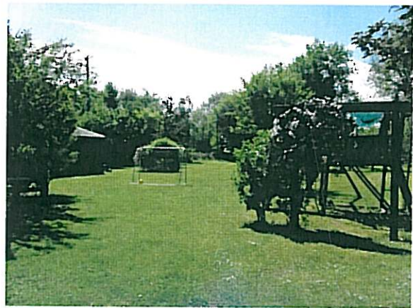
View of Rear Garden