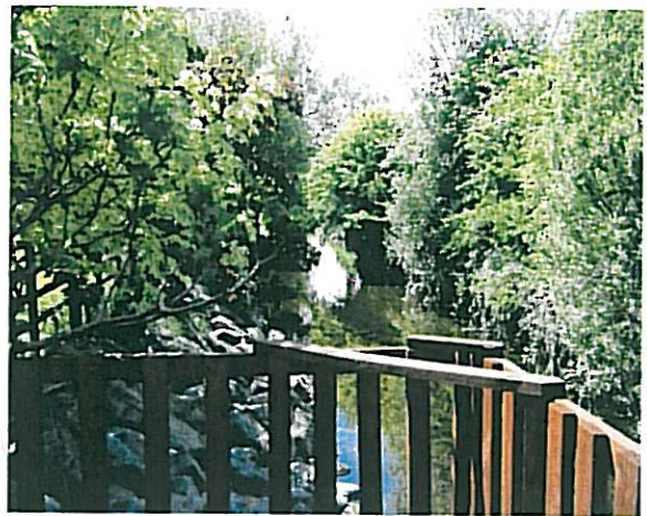
Decking Overlooking River Owenass