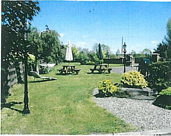
View of Front Garden