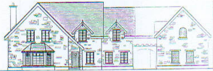
SITE ELEVATION Scale 1:200