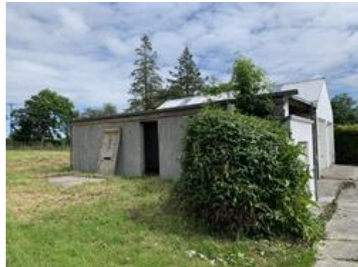
Fuel Shed side elevation