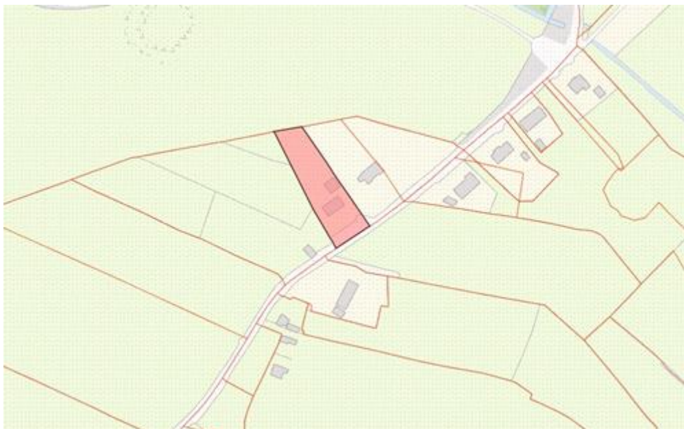
Map of Property