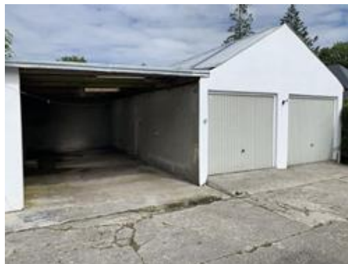
Double Garage & Fuel shed attached