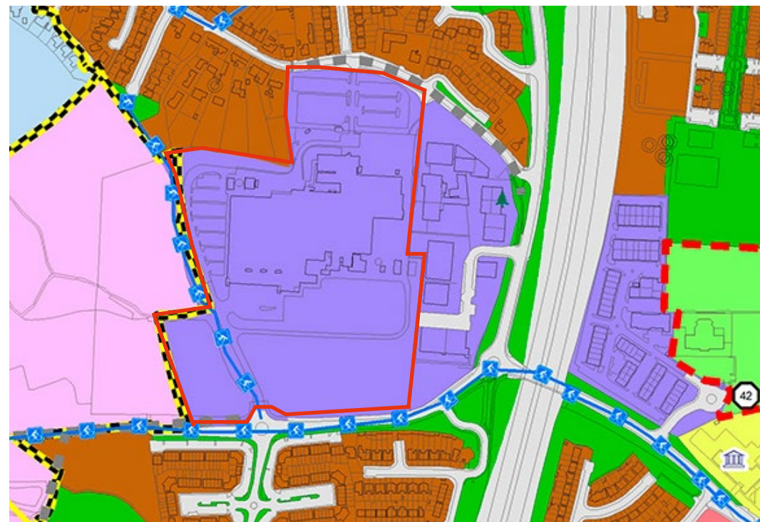
Zoning Map Extract taken from Fingal County Council Proposed Development Plan 2017 – 2023

The Fingal County Council Development Plan 2017 – 2023 is currently at the consultation stage with local vested interests prior to formal publication. The current zoning which prevails is not anticipated to be amended.