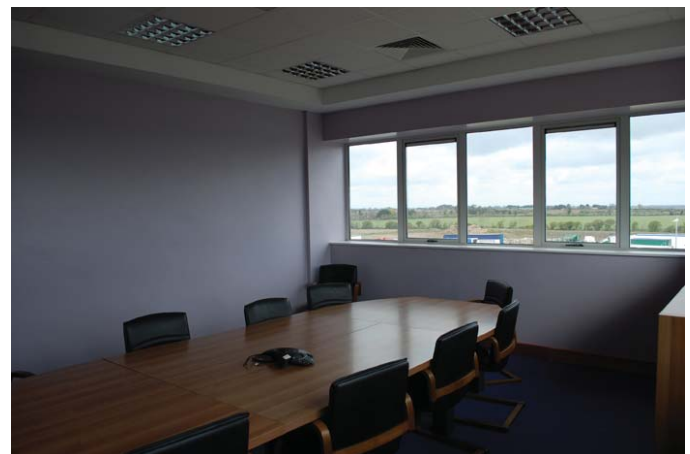
Second Floor Boardroom