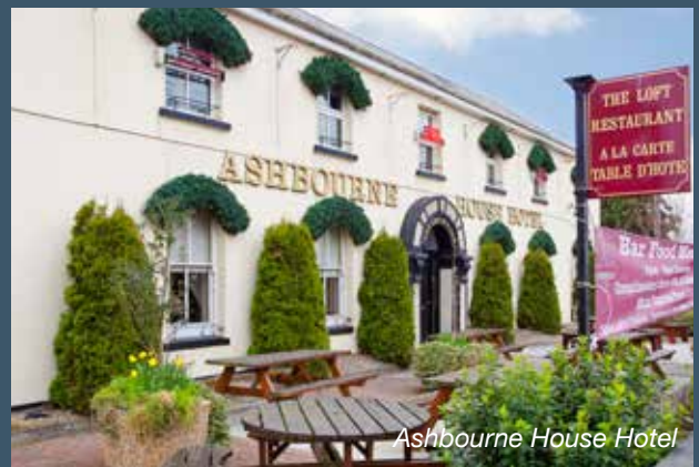
Ashbourne House Hotel