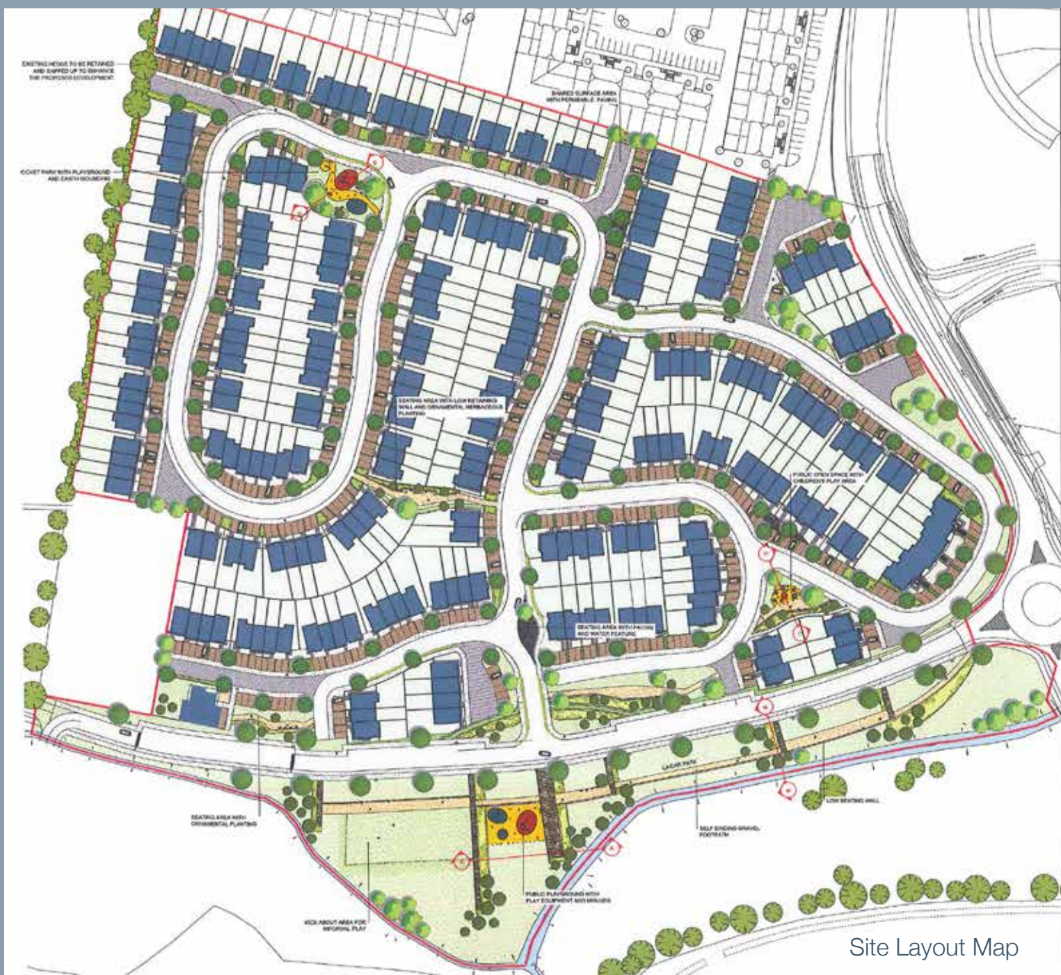
Site Layout Map