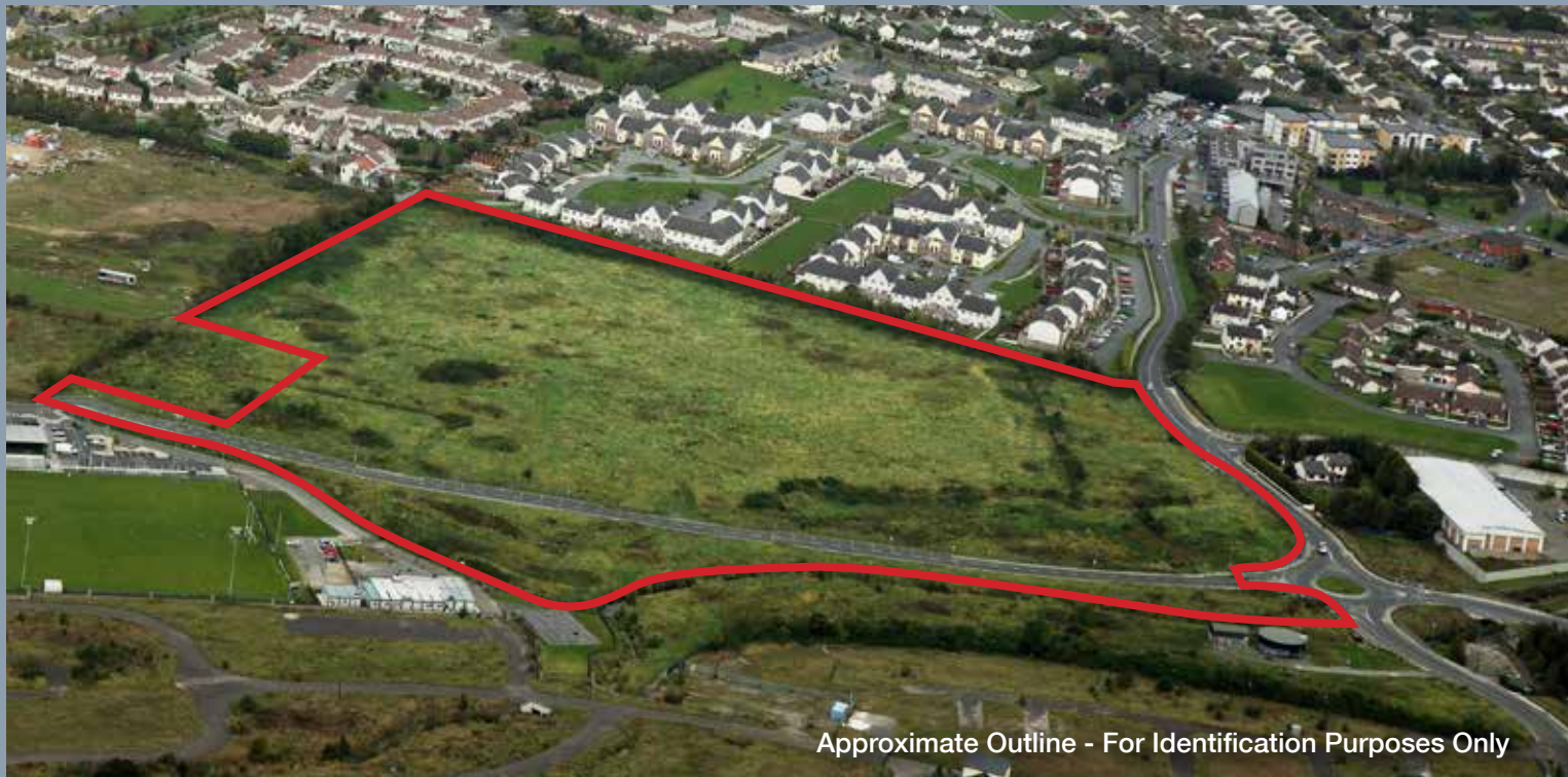
Approximate Outline - For Identification Purposes Only