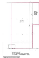
view unit plan