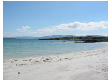
Secluded beach at Reen.