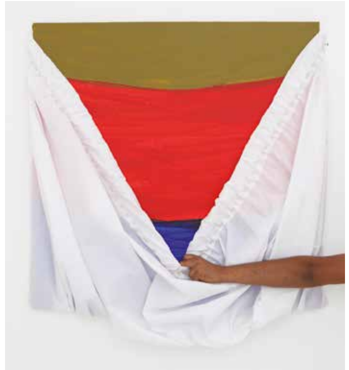
Bakh Bakh , 1985/2015 Acrylic and fabric on canvas, 90 x 90 x 12 cm