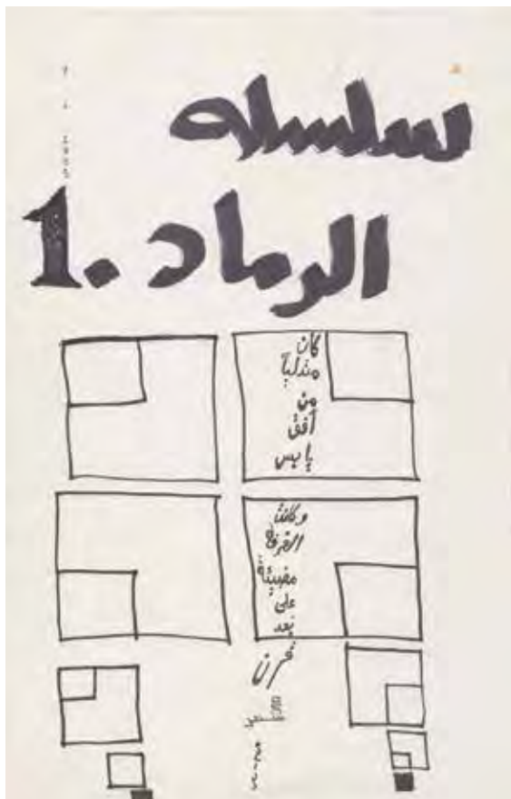
Silsilat Al Ramad , 1985 Artists' book, 29.7 x 21 cm