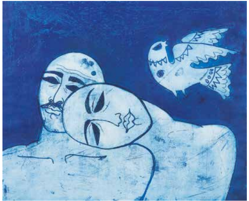
The Parting , 1991