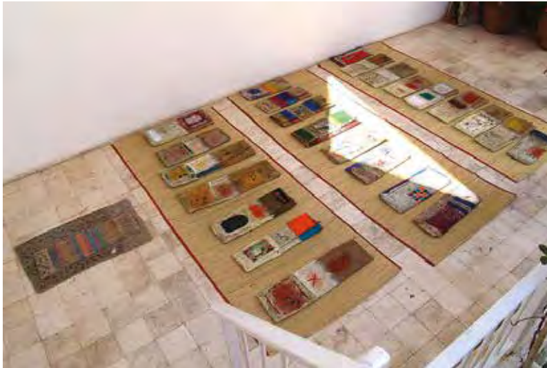
The Direction , 2007 Acrylic on burlap, 500 x 400 cm