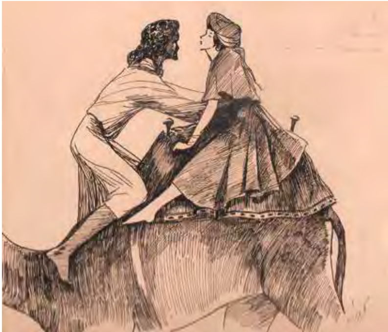
Untitled, n.d. Pen on paper, 17.1 x 20 cm