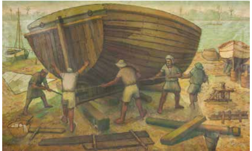
Luxor Port, 1964

Like many Gulf artists who studied in Egypt, Al Qassar portrayed people doing manual labor. He often depicted scenes of Arab culture and heritage, particularly concerning Kuwaiti fishing life in the Gulf. The artist's dynamic use of color and line to create depth and movement made him one of Kuwait's most technically versatile practitioners in this period.