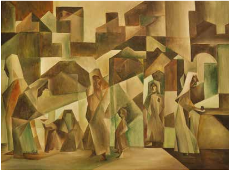
Worshippers Leaving the Mosque , 1981 Oil on canvas, 89 x 115 cm