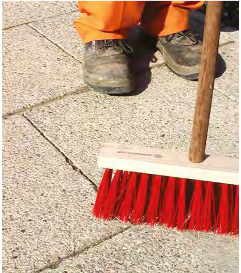
Brooms of Wisdom , 2007 Photographs, acrylic cases, brooms, dimensions variable

Her work was included in several Circle Group exhibitions, including The Circle 3 (2005), which focused on new forms of contemporary art being practiced in Oman and the Gulf, and The Circle 4: The City and the Street (2007), which explored the relationship between art and public space, including references to the street sweepers in Al Riyami's Brooms of Wisdom . Al Riyami also founded the Al Rozana Arts Collective, which engaged in contemporary issues through art, with a group of fellow artists in Oman.