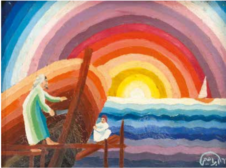
Building of Ships, 1966 Oil on canvas board, 30 x 40 cm