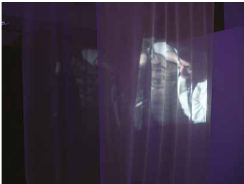
Fatma , 2005 Video, fabric, dimensions variable

In Sonya's efforts to capture the beauty and heritage of a rapidly modernizing Oman, he created strikingly detailed landscapes and expressive portraits. In his later practice, he became versed in a range of media and experimented with video in The Circle Group . Throughout his practice, he continued painting on the subject of Oman and its landscape.