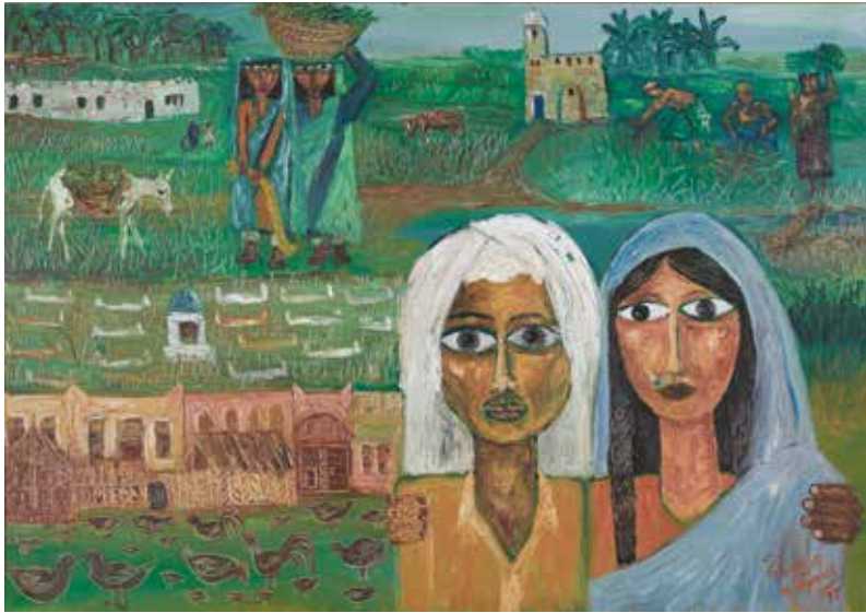
Our Green Land, 1977 Oil on canvas, 70 x 100 cm