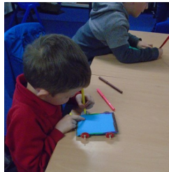
KS1 children making balloon cars

The children who participated in the engineering after school clubs this week all had a fantastic time and went home with their working models. www.stemkids.co.uk