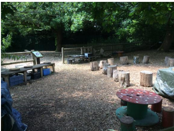
Mud Kitchen & Outdoor Learning Environment

"Fun was had working together to make our Grounds beautiful. So fantastic and hopefully easier to use."