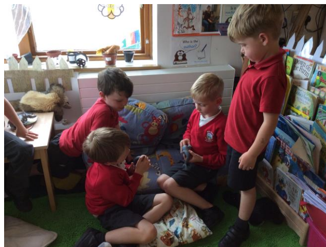
Boys from Beech Class enjoying looking at model animals.

The children are enjoying looking at the caterpillars as they change into a chrysalis. They have enjoyed touching and looking at our range of model insects, bugs and mini-beasts. They have looked at odds and evens and repeated patterns in maths. The children have drawn their own insect, mini beast and written labels for the body parts. In PE the children have practised for Sports morning.