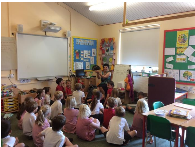
Hawthorn Class practising their French.