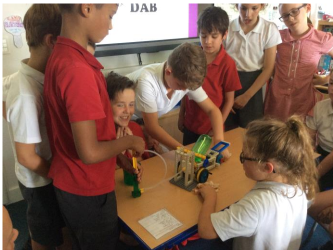
Silver Birch investigating their air and water rocket

This week Year 5 / 6 have thoroughly enjoyed building electrical games / toys ready for a Dragon's Den presentation. They have painted water colour meadow scenes and used charcoal to demonstrate perspective in art. In maths the focus has been on algebra. The children have played rounders and cricket in PE lessons. They have worked hard at writing their own group "Varmint" poem and performed them. In DT air and water rockets have been built.