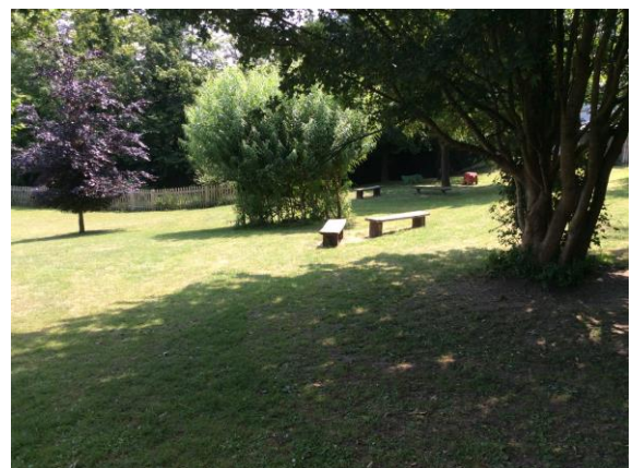
Children have enjoyed using the newly repaired seats.