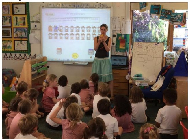
Ash Class learning about odd and even numbers.