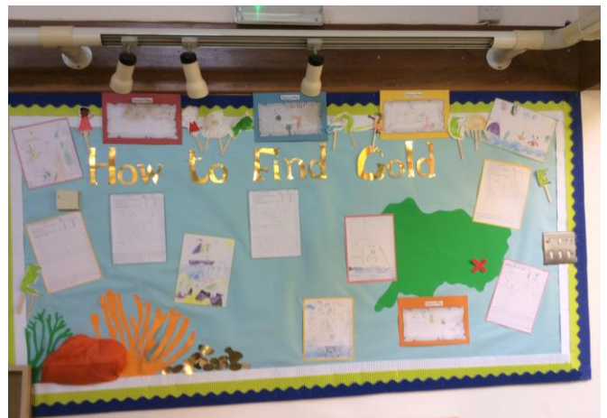
Year 1 have worked hard with their writing.