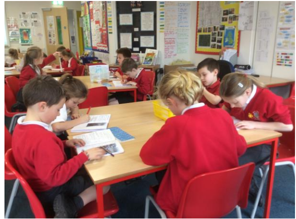
Thinking of tricky questions to ask interviewees!