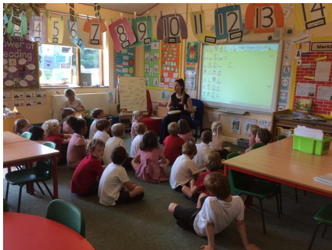
Elder Class singing in time in a music les