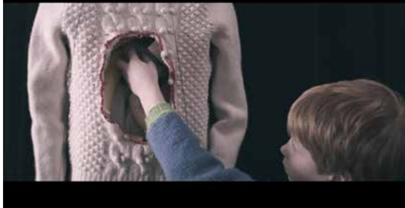
Stomach of the World , 2017. Video, color, sound, 44 mins 50 secs (video still)

Using media and languages derived from theatre, and by means of childhood imagery, Kotátková stages the fears and anxieties of childhood associated with the internal malfunctioning of the human body, but also with the external causes that can trigger physical discomfort and difficulties. At the same