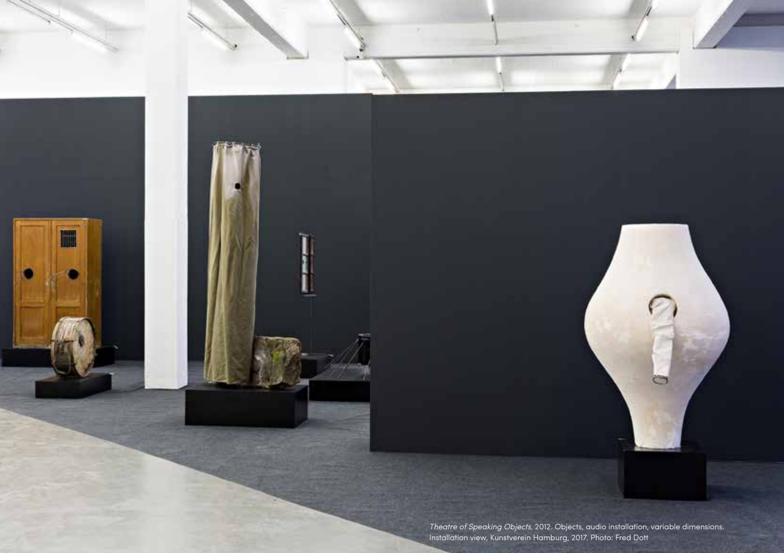
Theatre of Speaking Objects , 2012. Objects, audio installation, variable dimensions. Installation view, Kunstverein Hamburg, 2017.