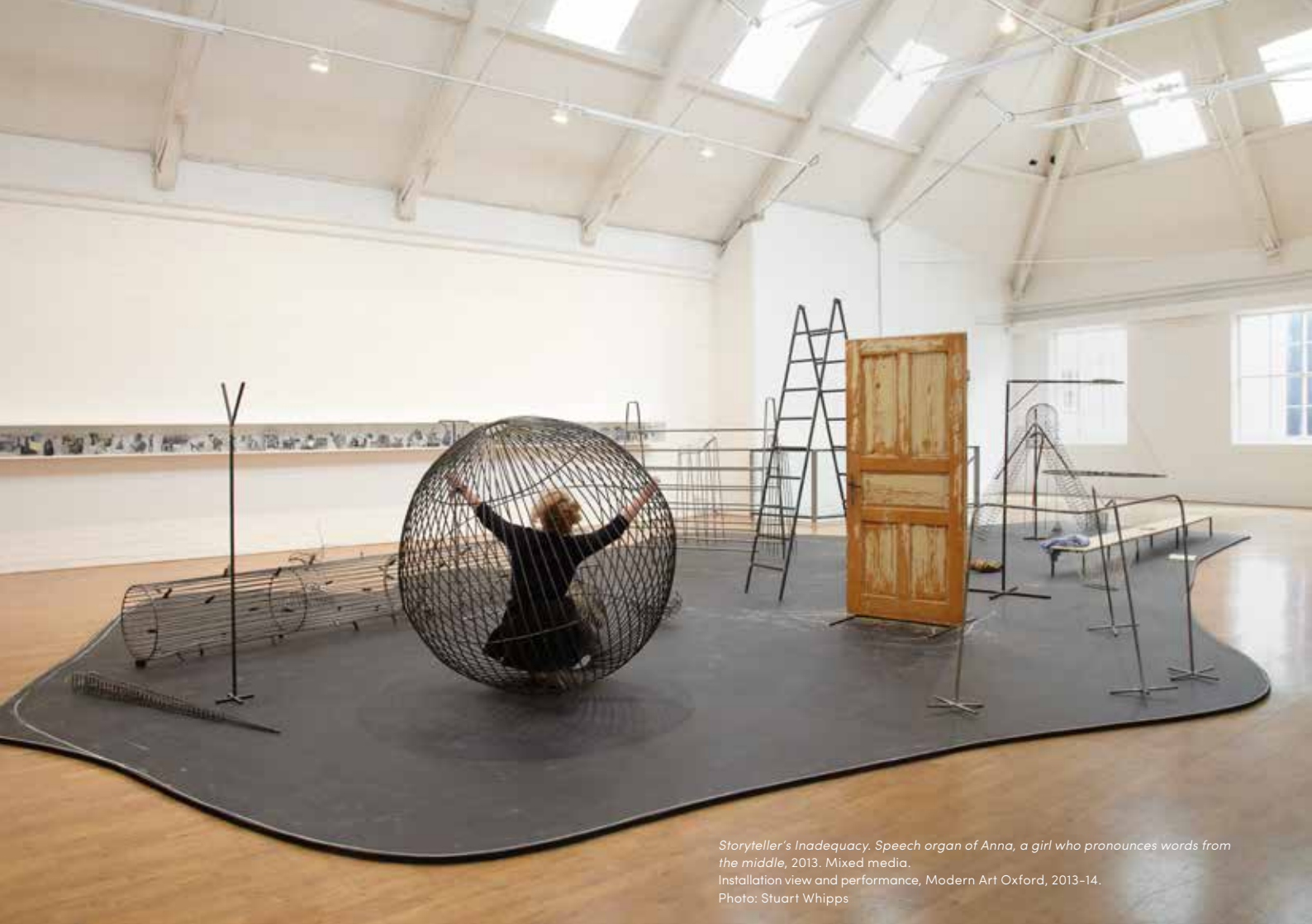
Storyteller's Inadequacy. Speech organ of Anna, a girl who pronounces words from the middle, 2013. Mixed media. Installation view and performance, Modern Art Oxford, 2013-14.