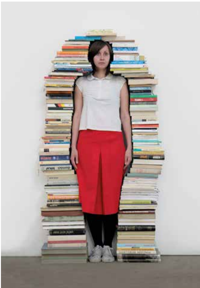
House Arrest n. 1 , 2009–2010. Books, performance, 180 x 85 x 30 cm