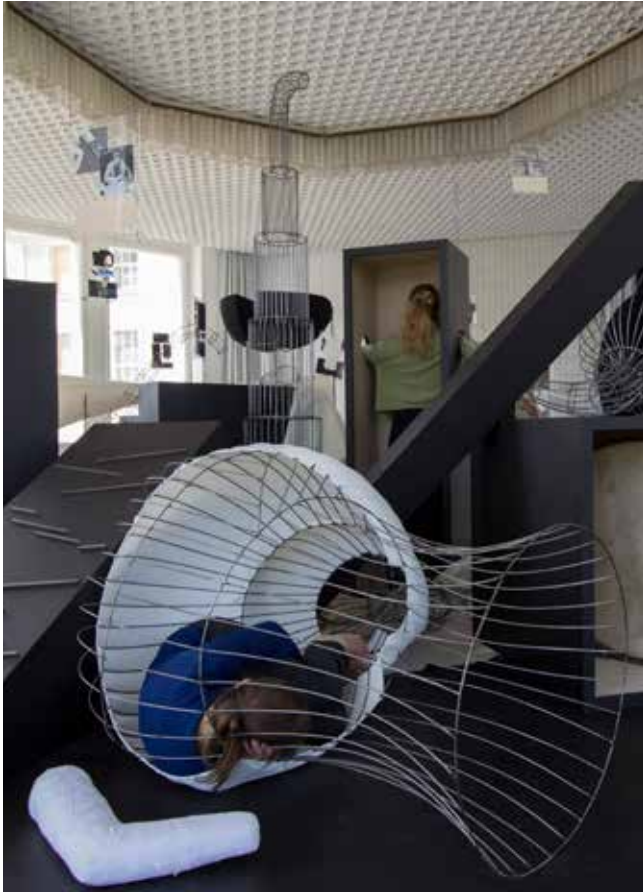
Anatomical Orchestra , 2014. Mixed media. Installation view and performance, Schinkel Pavillon, Berlin, 2014.