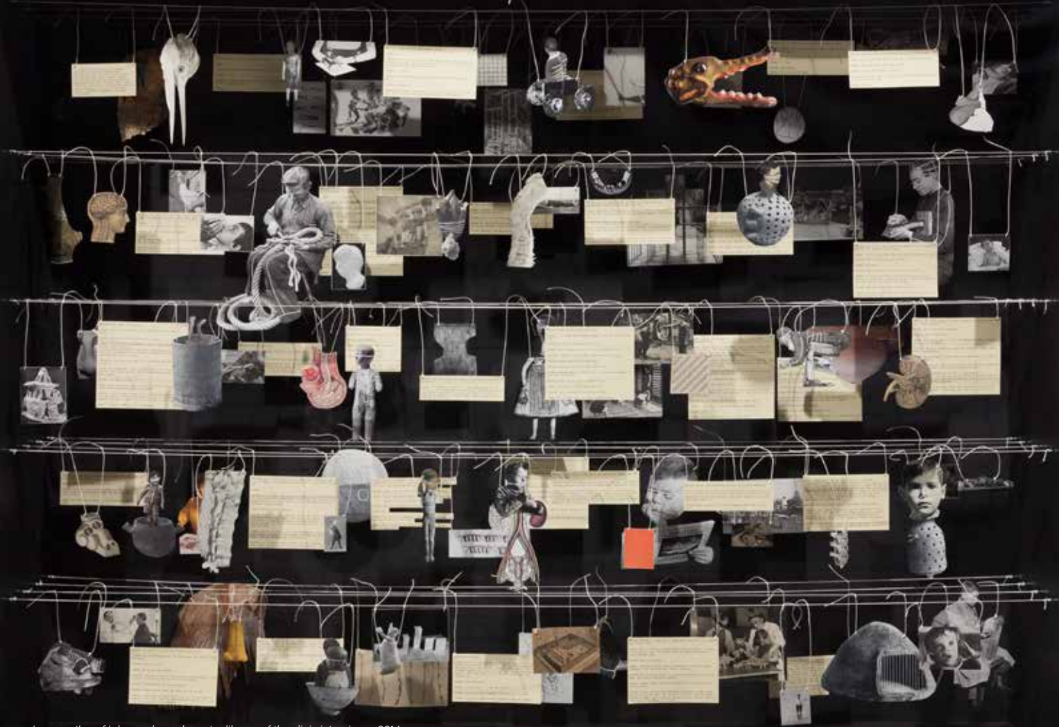
Image atlas of Johan, a boy who cut a library of the clinic into pieces, 2014. Glass vitrine, paper cutouts, strings, 140 x 185 x 35 cm.