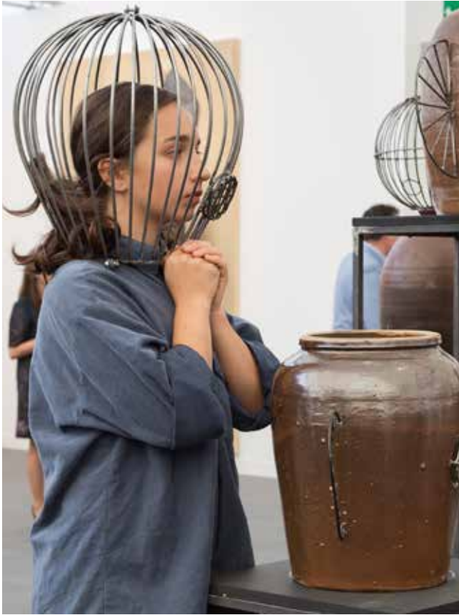
Collection of Suppressed Voices , 2014. Steel, fired clay, prints on paper, cardboard, chalk, baskets, wood, variable dimensions.

Installation view and performance, Frieze, London, 2015.