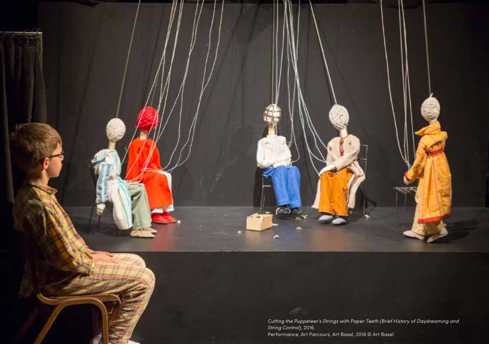
Cutting the Puppeteer's Strings with Paper Teeth (Brief History of Daydreaming and String Control) , 2016.

Performance, Art Parcours, Art Basel, 2016