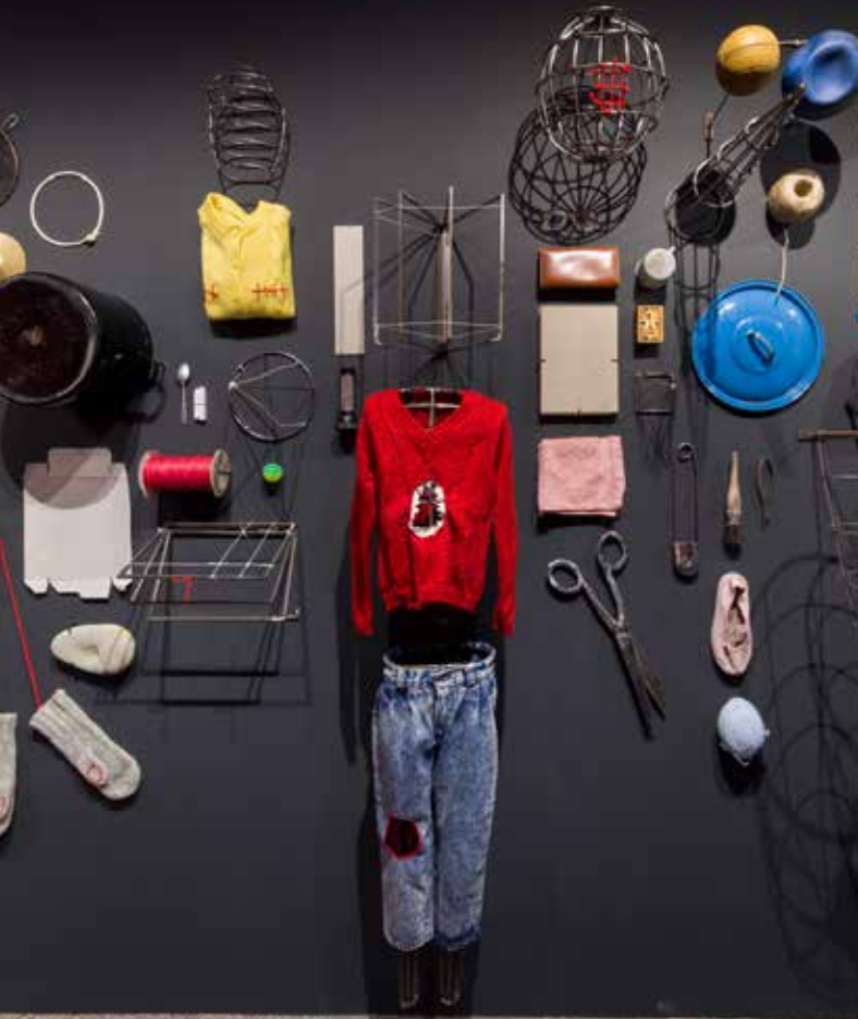
Stomach of the World , 2017 (detail). Mixed media, variable dimensions. Installation view, Belvedere 21, Vienna, 2017.

Composed of large-scale installations and sculptures, the exhibition narrative starts with the 2017 work entitled Stomach of the World , which leads visitors into Kot'átková's imagination through a long, labyrinthine corridor. Some of the works serve as stage props, which can be activated by performers at certain times of day, while others are devised to host different activities involving the visitors.