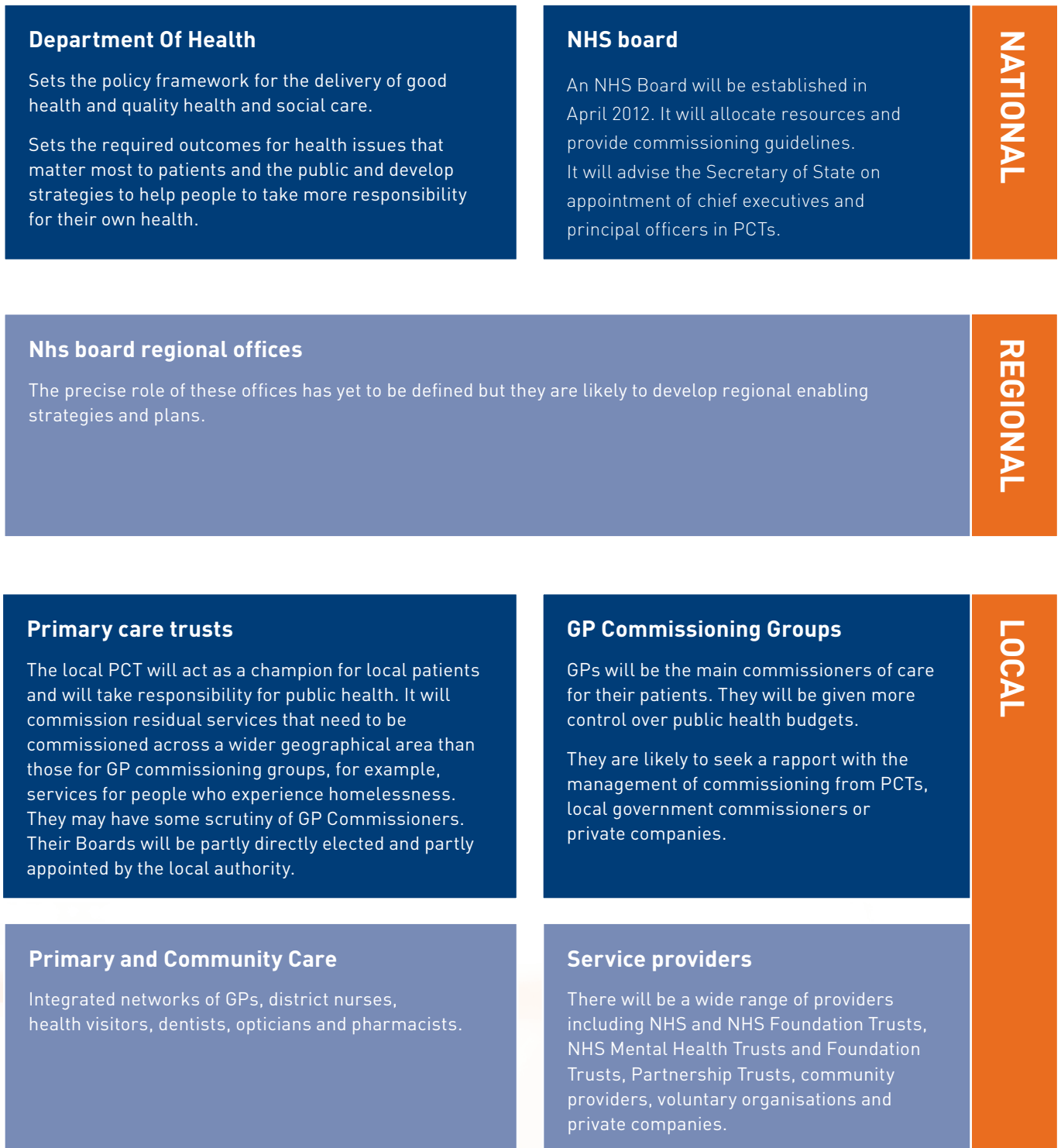
Figure 4: Possible structure of the NHS in England: 2010 onwards