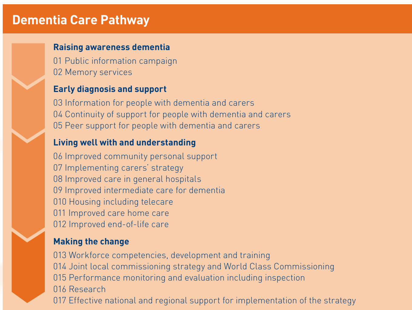
Figure 8: Joint commissioning of services within a defined care pathway to enable people to live well with dementia 29

These preparations include personal health measures, design and technology adaptations for the home, legal preparation for handing over executive and financial functions to trusted friends or relatives, and conscious planning to maximise the quality of life for the time that is left to them. One example of the pathway is set out by the Dementia Services Guide in Figure 8.