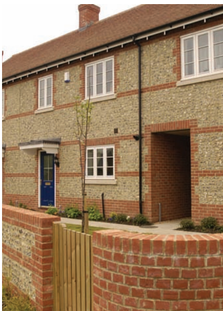
Sixteen homes for rent and low cost home ownership provided on a quota site at Okeford Row, Shillingstone, Dorset.

appropriate for you to have a more informal conversation before the enabler organises a meeting. If it is another landowner or large estate, the experience of the enabler and/or housing association may make them better placed to put forward the proposal. The formal discussions will happen between the association and the landowner with whom the contract is signed.