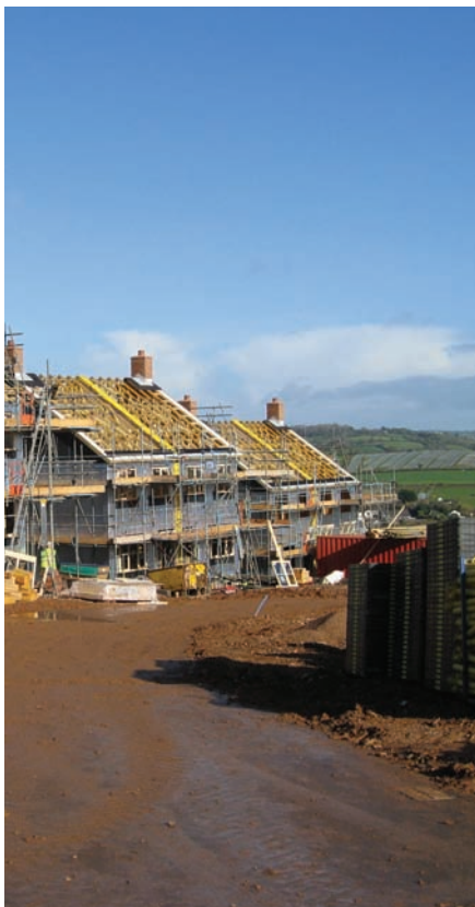
Twenty homes for rent under construction at Colyton, Devon.

Preparing for the planning application is one of the most time consuming elements of the process. There are numerous and often lengthy consultations needed between all partners to make sure the evidence, design, cost and location of the development deliver the right homes in the right place.