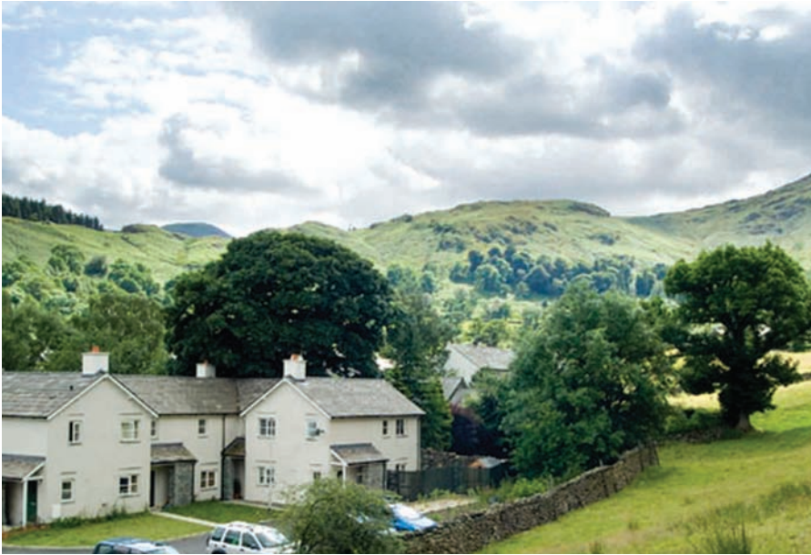
Barraclough Fold, Glenridding, Cumbria where nine affordable homes were provided as a priority for local people.