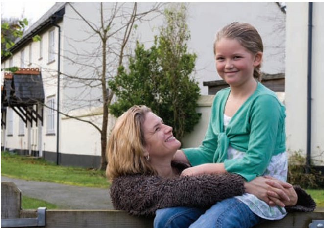
Two of 10 homes built in two phases at Brook Lane Cottages, Widecombe-in-the-Moor, Devon