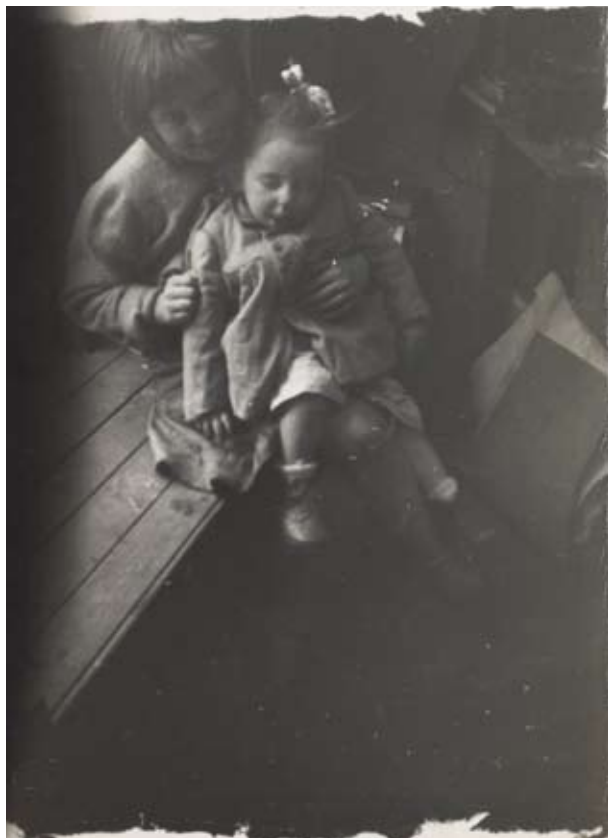
Photographs by Joan Eardley