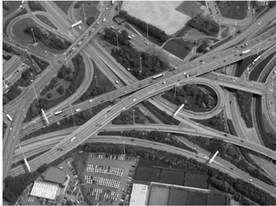
M8 Townhead Interchange, drawing and outcome, c. 1980's and far right, c. 1973