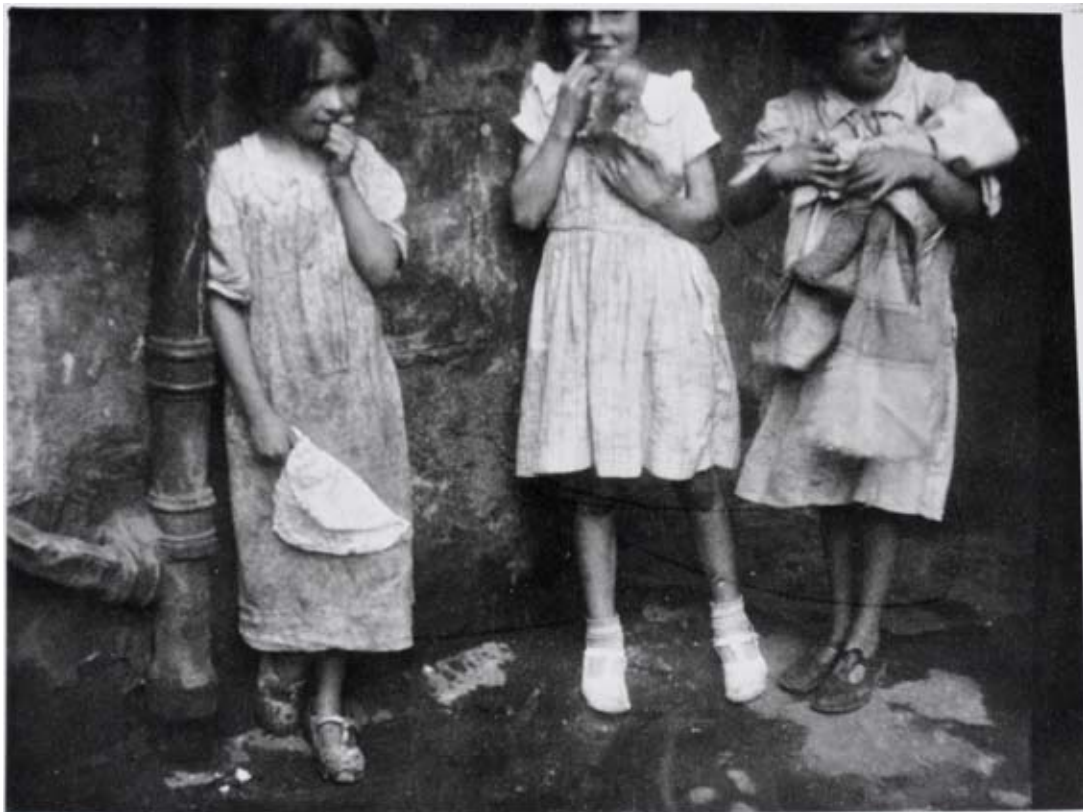
Photographs by Joan Eardley