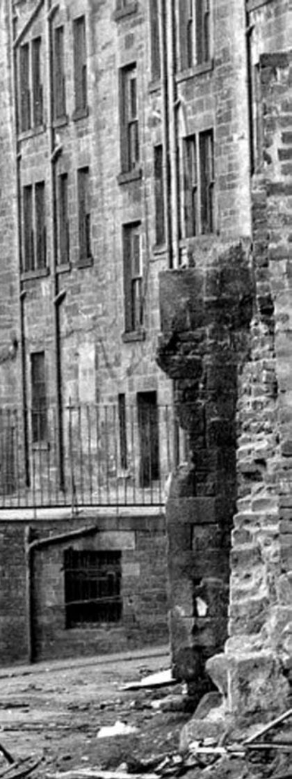
High Street at Rottenrow, Townhead c. 1959