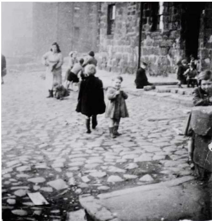
Photographs by Joan Eardley