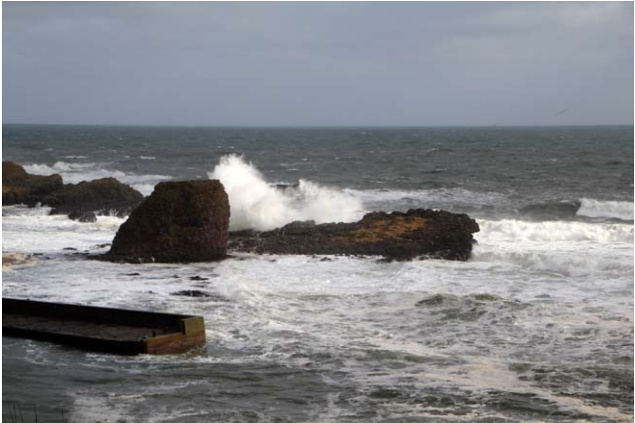
Catterline, March 2013