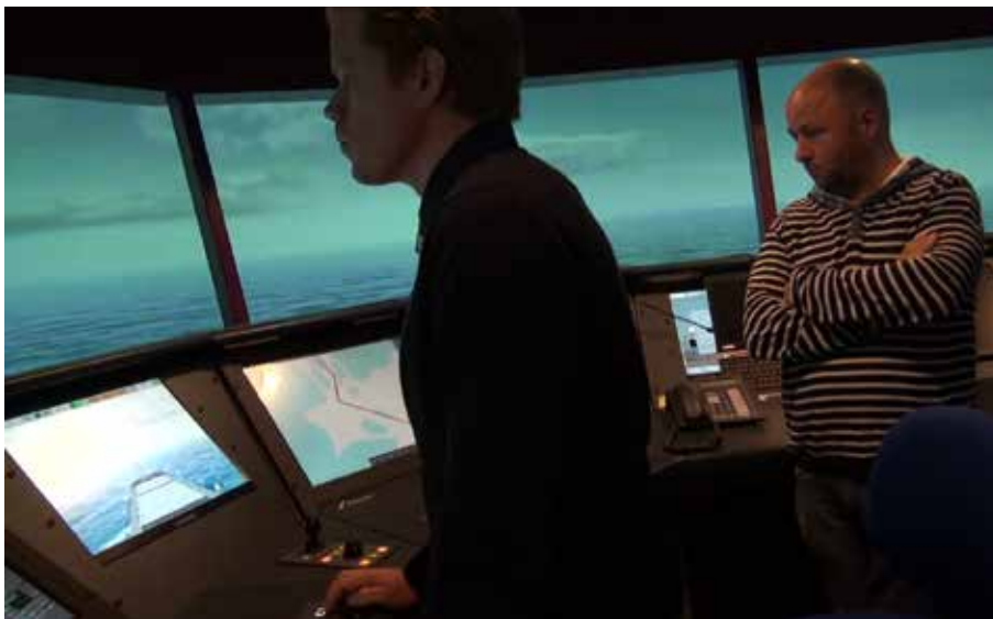
Figure 4. Watch officer and captain on the simulator bridge. The route is visible in the prototype screen (scenario 4, before the MSI with drifting timber has been received).

Information) is sent out and displayed in the chart (see Figure 3, lower right). STCC suggests a route change around the dangerous area, which is negotiated and agreed (see Figure 4).