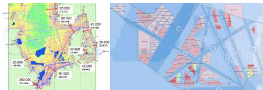
Figure 1. To the left, a prognosis for the future state of ship traffic in the North Sea. The figures are the numbers of ships expected to pass respective red line in 2025 (the figure in

Another factor is the increased complexity of ship traffic. The North Sea is an extremely busy shipping area and the English Channel the busiest strait in the world (133 444 ship passages 2012). Predictions made in another EU research project, ACCSEAS, predicts that this number will increase to 200 000 by 2025 (ACCSEAS, 2013). To further complicate the picture, there is a rapid exploitation of sea areas for wind energy. In the German Bight for instance, 10 000 wind turbines are currently being planned to replace the German nuclear power. And to achieve the EU goal of 80 % reduction mentioned above, sea-based wind farms must keep expanding. In Figure 1 (left) the projected state of the North Sea is shown with the number of ship traffic passing the red lines (and the 2012 figure in brackets). The dark blue polygons are areas where there today is open sea, and tomorrow will be wind mill farms. In Figure 1 (right) a close up of the "windmill city" of the German Bight where shipping risk being conducted under more or less "street-like" conditions.