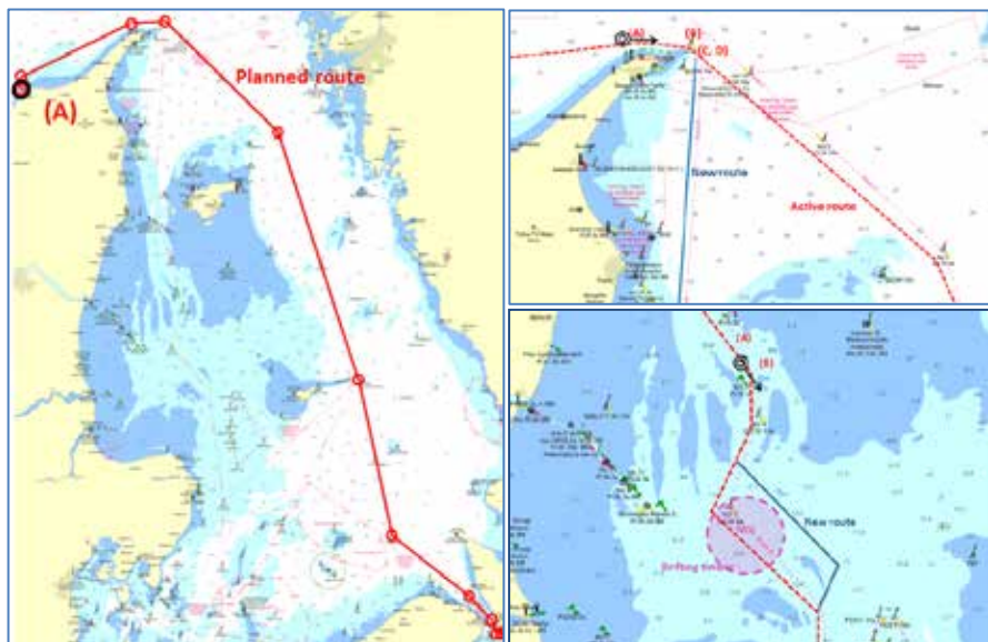
Figure 3. Three of the four test scenarios. Left scenario 1 with the route from Hirtshals to Helsingborg that the bridge crew was to plan. Top right, scenario 2, a route change done underway initiated by the ship. Bottom right, scenario 4: drifting timber causing STCC to suggest a route deviation. (The images are just scenario descriptions, not ECDIS with MONALISA symbology.)

planned, the route is sent to STCC. STCC checks the route and sends a “recommended” route back. The ship finally “acknowledges” the route (see Figure 3, left).