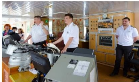
Using digital to keep the crew in shape: Start-up of the year 2017