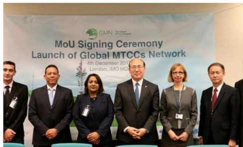
IMO brings technology cooperation centres together in network to promote decarbonisation and innovation