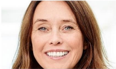
Video: Meet the digital changemaker of the year 2017

A new project in France joins a number of others hoping to demonstrate the viability of hydrogen as a marine fuel