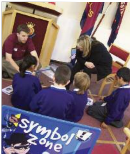
Carrying out a mission in the Symbol zone