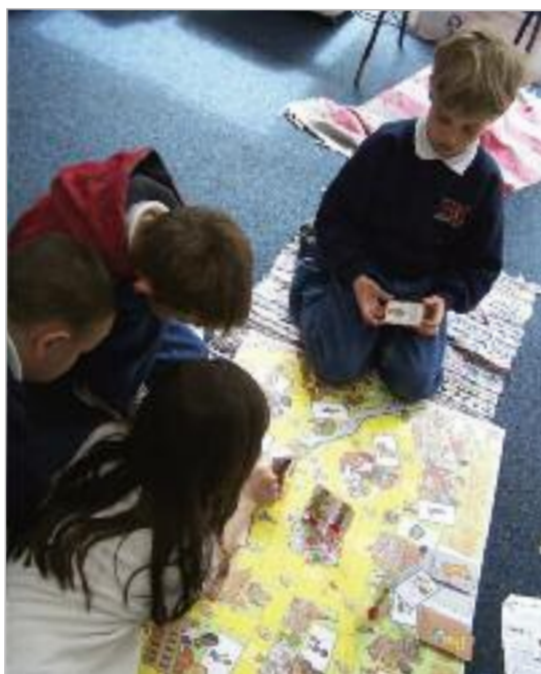
The Salvation Army and the Community game