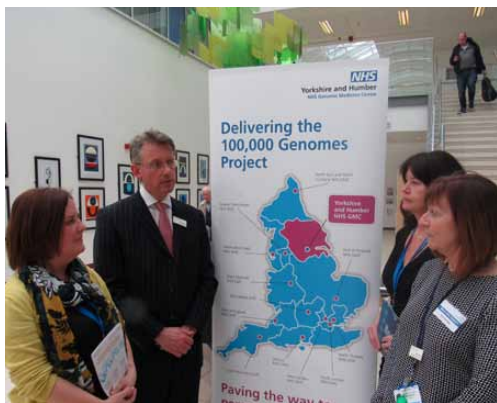
Promoting research into rare diseases