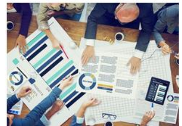
Value Chain Analytics