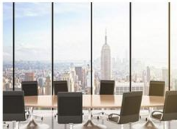
Boards In Control

TPA Global provides pragmatic solutions and helps you implement them!