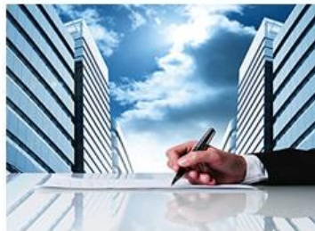
TPA Global Profile