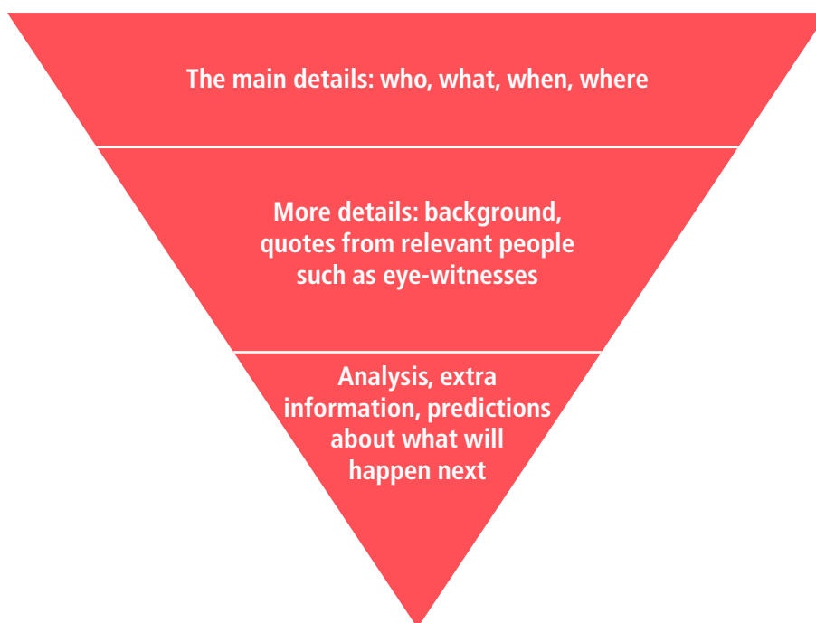
The inverted pyramid structure of articles