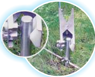
Quick release static grounding clamp supplied with the Earth-Rite MGV attached to buried rod.

When the Static Ground Verification and Continuous Ground Loop Monitoring checks are positive, a cluster of attention grabbing green LEDs pulse continuously informing the operator that the truck is securely grounded.