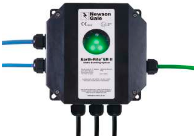
The Earth-Rite MGV static grounding system enables operators demonstrate compliance with the API 2219 standard.

To eliminate the risk of incendive static spark discharges the API standard 2219: Safe Operation of Vacuum Trucks in Petroleum Service recommends that vacuum truck operators transferring flammable and combustible product in hazardous locations must fully ground the truck prior to any other task in the transfer operation by connecting the truck to a "proven ground source". The Earth-Rite MGV is designed to enable operators establish safe grounding of their vehicle in accordance with this standard.