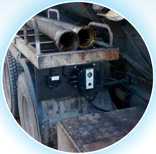
The Earth-Rite MGV static grounding system can be mounted on vacuum trucks and tank trucks.