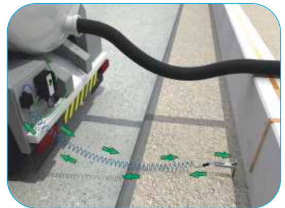
Continuous Ground Loop Monitoring check