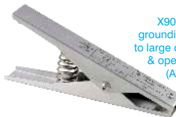
X90 stainless steel static grounding clamp for connection to large containers including IBCs & open top 205 litres drums. (ATEX/FM approved)