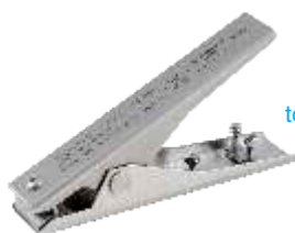
X45 stainless steel static grounding clamp for connection to closed top 205 litres drums and smaller drums & vessels (ATEX/FM approved)