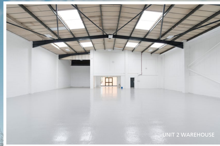
UNIT 2 WAREHOUSE