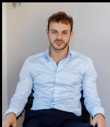
DANIEL JACKSON AGENCY dj@belcor.london 07725 203 254