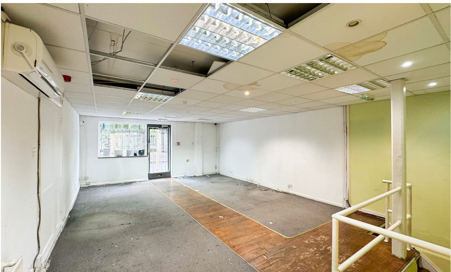
47 Chalton Street