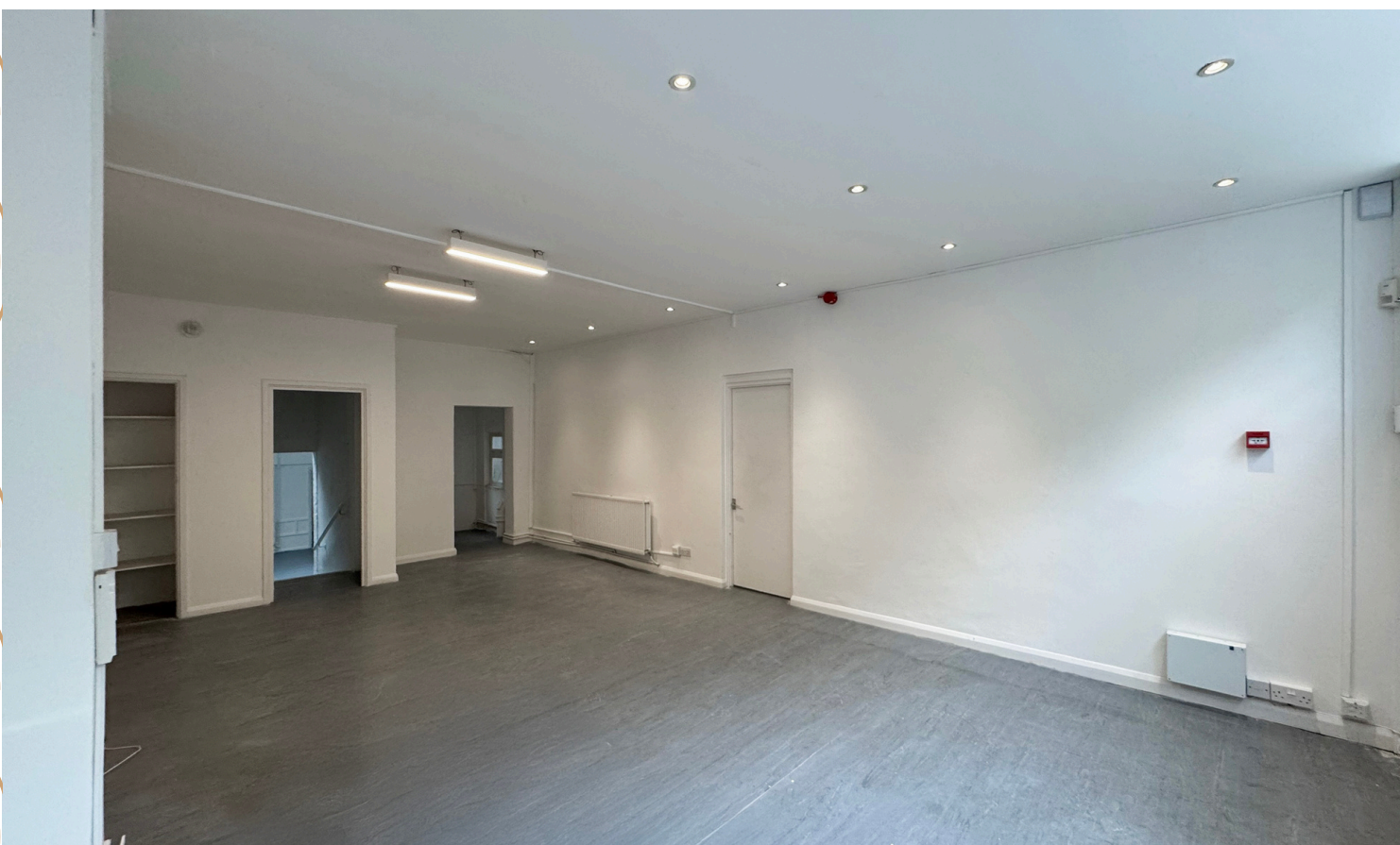
49 Chalton Street