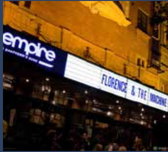
Shepherd's Bush Eimpire