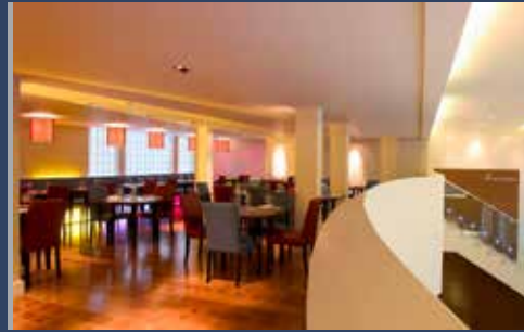
Studio Kitchen - K West Hotel