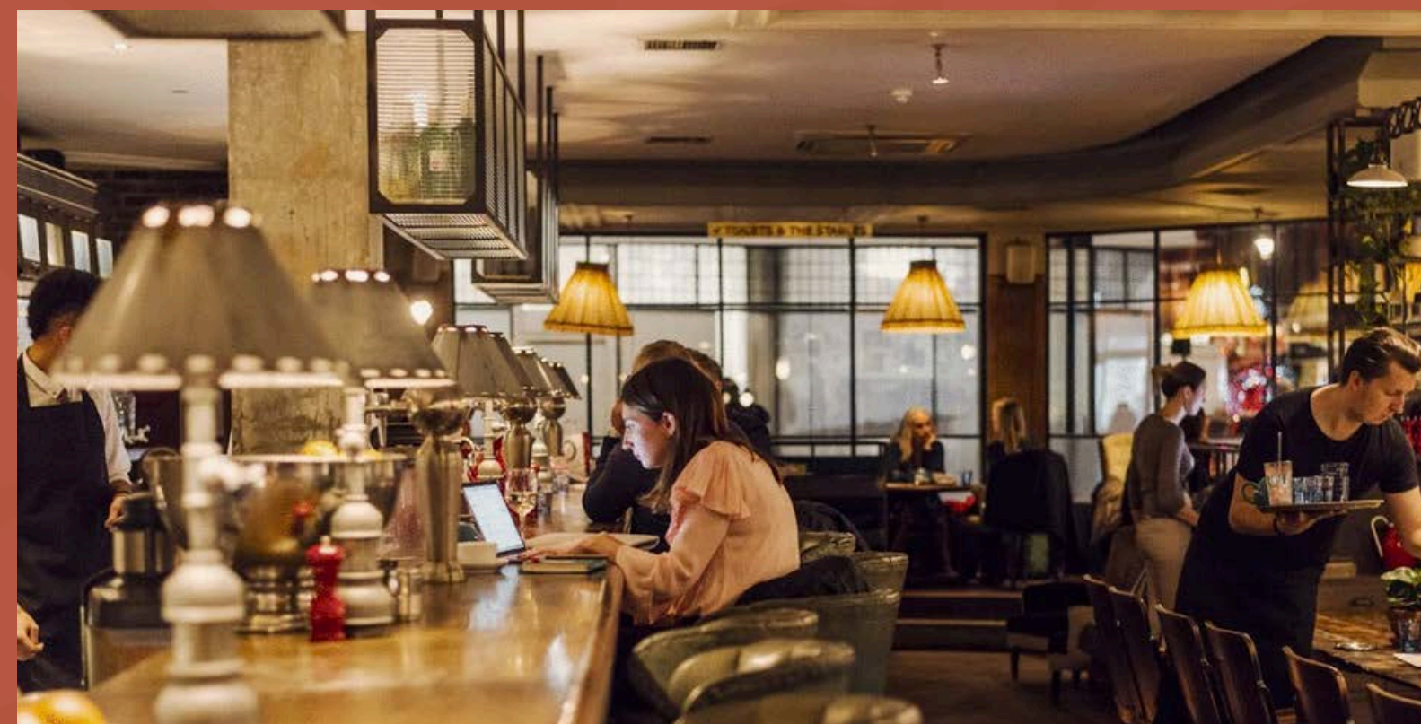
THE RIDING HOUSE CAFE