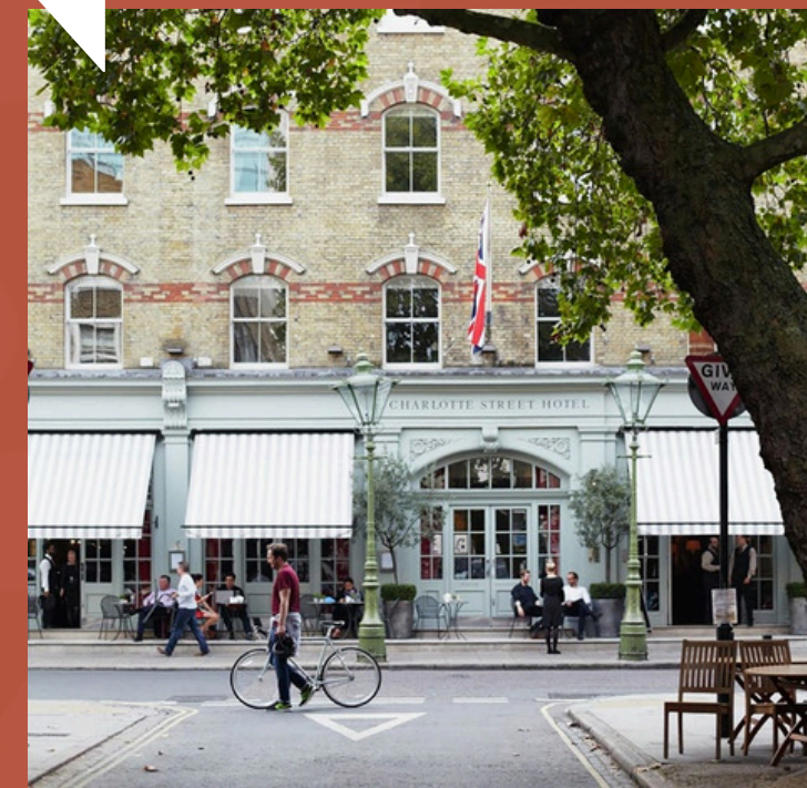
CHARLOTTE STREET HOTEL