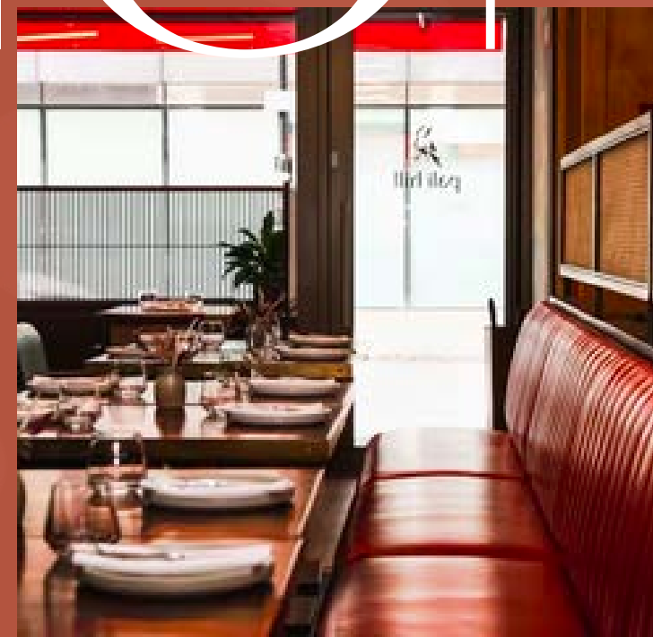
PAHLI HILL BANDRA BHAI

The property benefits from excellent transport links including Oxford Circus (Victoria, Central & Bakerloo lines), Tottenham Court Road (Elizabeth and northern lines) and Goodge Street (northern line) all within a short walk.