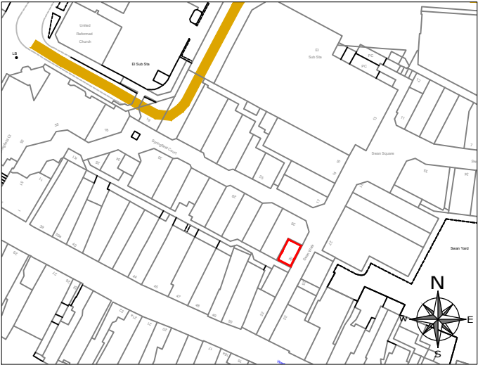
LOCATION PLAN SCALE 1:2000